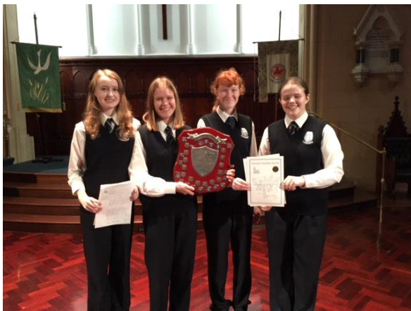
Caption: Marryatville High School Swing Tones. First prize winners and winners of the Bank SA Perpetual Shield in Section C003 for School Years 8 to 12 small choirs Marryatville High School Swing Tones.

Each year the Adelaide Eisteddfod Society Inc. hold competitions June to September. There are a ten Divisions including guitar, choral, piano, recorder, flute, brass, woodwind, string, ensemble, concerto and vocal. All competitions are open to the public, so next year, if you want to experience a wonderful afternoon or evening of special entertainment from our young people and the not so young, go on-line to find out the dates and venues.