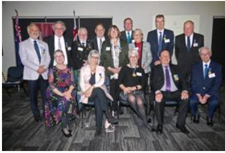
Caption: South Australian recipients of the Queen's Birthday Awards at the Branch reception 27 th September 2018.