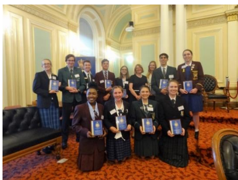
Caption: Her Honour with the 2018 award students – Back row from L-R -