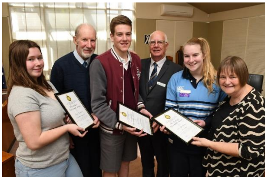
Yarriambiack Photo (Courtesy of the Warracknabeal Herald)

The Hindmarsh and Yarriambiack Shire Councils, being small rural Councils, both have three Secondary Colleges within their boundaries, and each College was represented. We look forward to seeing more of these fantastic young people in the future.