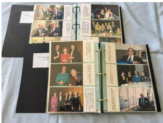
CAPTION - Two of the albums