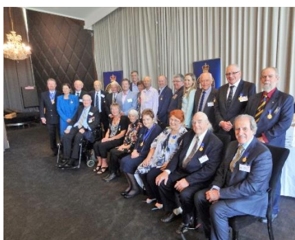
Caption: Our 21 Queen's Birthday award recipients at the Celebratory Lunch