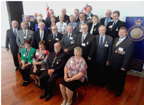
The twenty-six award recipients with the Queensland Branch Chairman ( 3 rd from left in front row) - Moda at Portside celebratory Lunch.

The Committee found the surroundings at the new venue at Moda at Portside very pleasing indeed. A further highlight of the event was the performance by two musical ensembles from nearby Clayfield College. On behalf of the Queensland Branch I presented each of the musicians with a special Certificate of Participation.