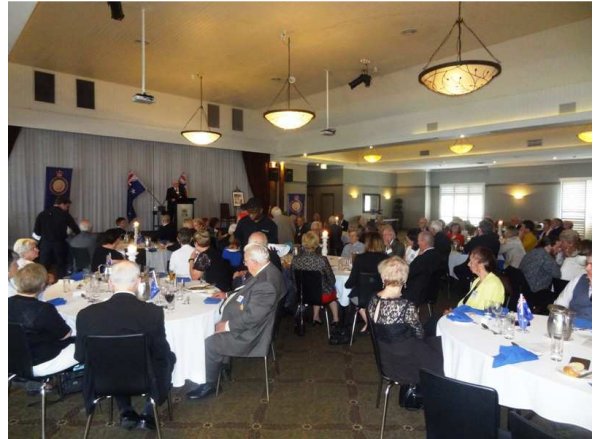
Some of the guests enjoying great fellowship at Hillstone St Lucia at the Celebratory Award Recipients Lunch.