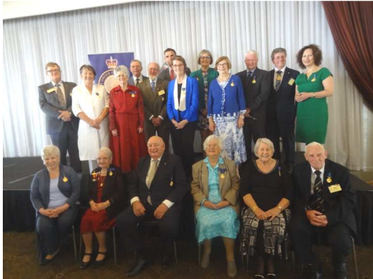
The eighteen award recipients at the Celebratory Lunch at Hillstone St Lucia