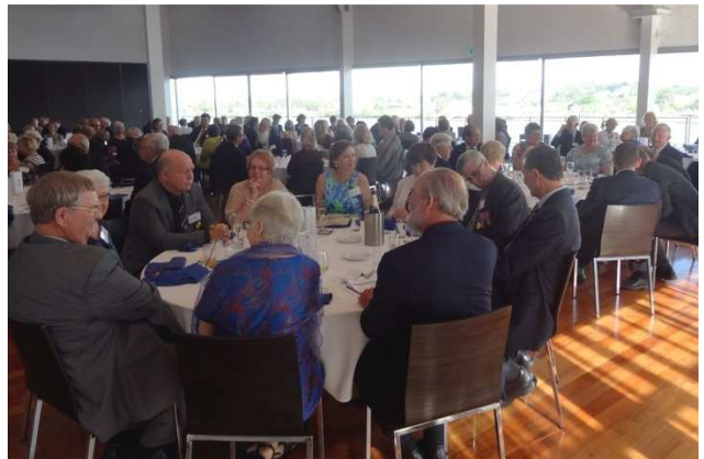
A portion of the 131 guests at the Moda at Portside Celebratory lunch