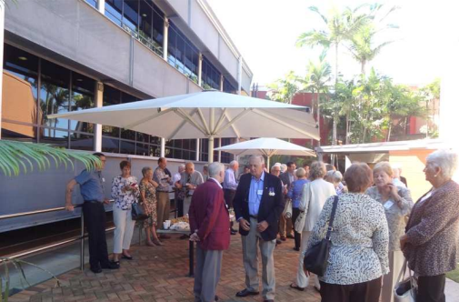
Some of the gathering at the morning tea at the Kedron Emergency Services Complex