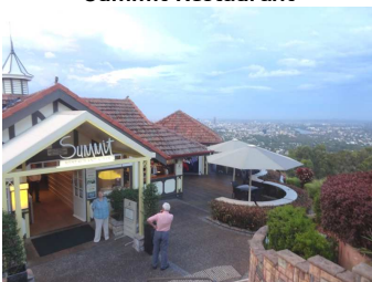
Welcome Dinner - Summit Restaurant