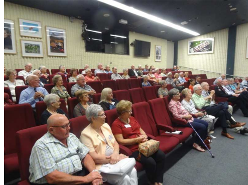
Listening intently and learning much about Queensland's emergency services capability.