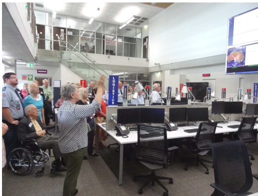
During the guided tour of the State Disaster Management Centre