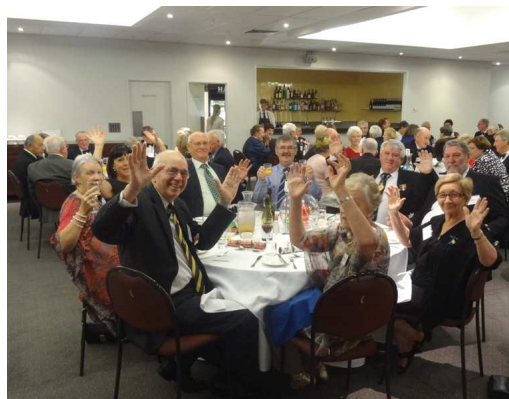
A Happy “Table 9” at the Annual Dinner