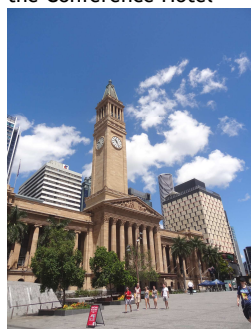
Brisbane City Hall - venue for Conference Dinner and The Pullman (right) - the Conference Hotel