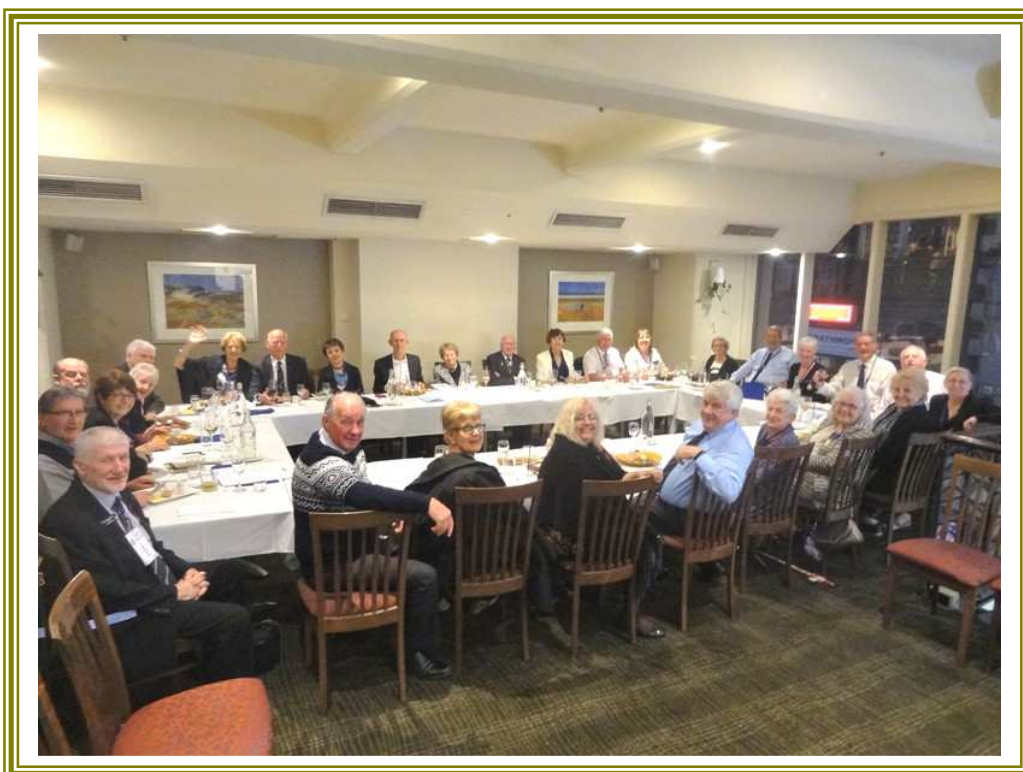
Queenslanders and Honorary Queenslanders at the Traditional Queensland Dinner – Friday 4 May 2018 at the Mercure Grosvenor, Adelaide during the 32 nd National Conference

This was an excellent dinner and it further strengthened the Queensland Branch members' participation and supported a tradition established several years ago by the Queensland Branch. We plan to continue this tradition at the conference in Tasmania in April this year and I invite you to participate.