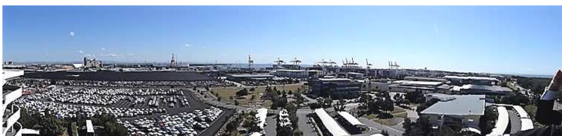
Panoramic view of the Port of Brisbane from the top floor of the Visitors' Centre building