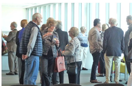
Portion of the gathering enjoy morning tea in the Cerberus Room

For convenience, the Branch organized a bus to the Port and subsidized the cost to members. After the formal proceedings the group was treated to a comprehensive, one hour "windscreen tour" on the bus and a viewing from the top floor of the Visitor's Centre building seeing first hand the very busy day to day activity of Australia's third busiest port.