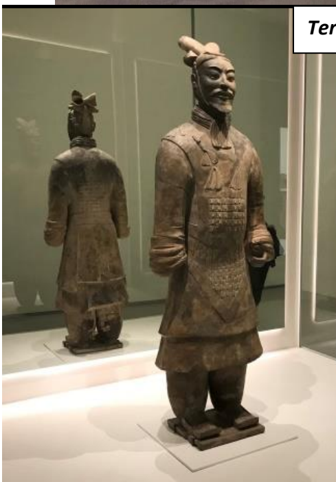
Terracotta Armed General