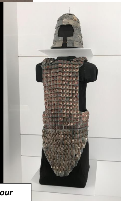
Terracotta suit of armour