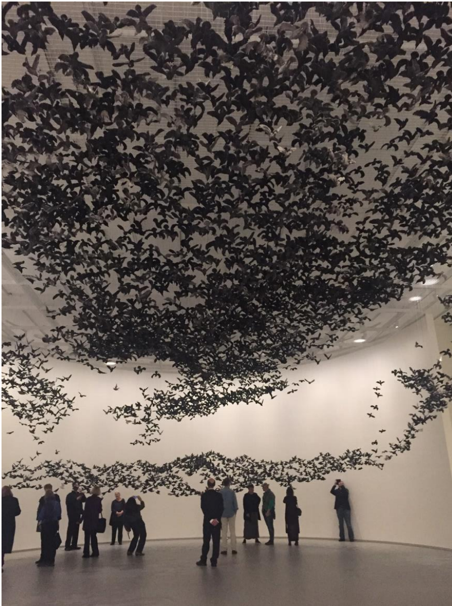
Handmade porcelain birds – white – then covered in gun powder. Individually hung from the ceiling.