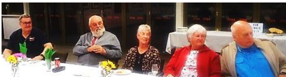
NTOAA Members enjoying their night out in Alice Springs