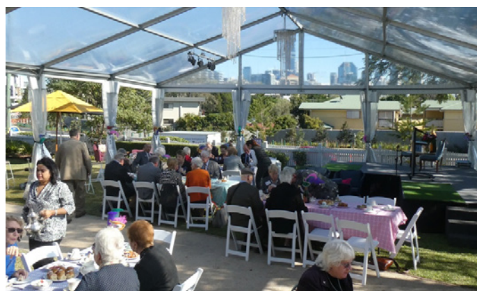
Some of the 51 guests enjoying their garden party style morning tea overlooking the Brisbane City Skyline.

Our morning tea was memorable for its garden party style with guests seated at tables under huge marquee overlooking the Brisbane city skyline. Our thanks are extended to Marisa and her able staff for a most memorable occasion.