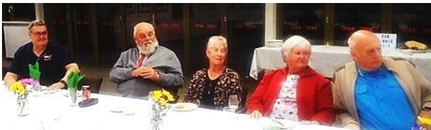
NTOAA members enjoying their night out in Alice Springs.