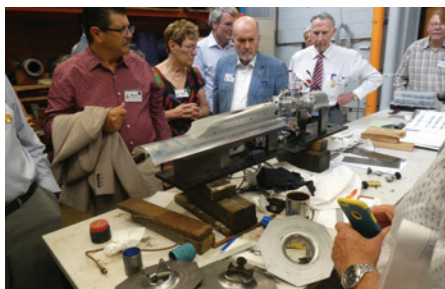
Members examining a scramjet engine.

Interested readers may find further useful reading at https://www.mechmining.uq.edu.au/research-hypersonics and https://www.uq.edu.au/news/article/2019/11/new-shock-tunnel-making-waves-hypersonic-testing