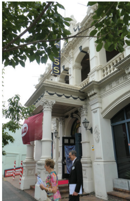
The magnificent front entrance of the historic Princess Theatre – note the Queensland State of Origin flag draped across the front.