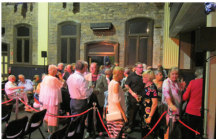
OAAQ and VLB members enjoy drinks and canapés in a dedicated area inside the Theatre before the performance.

Prior to the performance the members of both OAAQ and VLB in attendance enjoyed a Reception of drinks and canapés in their own dedicated space in the Theatre which added immensely to this special occasion.