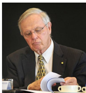
Prof Adm Chris Barrie AC.

The Branch is looking forward to our annual ANU lecture in early March with the Adjunct Professor of the Strategic and Defence Studies Centre, Admiral Chris Barrie AC (Retd). The title of his lecture will be "It's an Honour - Reflections" . Chris Barrie retired in 2002 after 42 years in the RAN, ending in four years of service as the Chief of the Defence Force (CDF). Since then he has worked on strategic leadership issues as consultant, teacher and mentor at Oxford University, the National Defense University in Washington DC, and at the Australian National University. Chris is also a member of the Global Military Advisory Council on Climate Change (GMACCC).