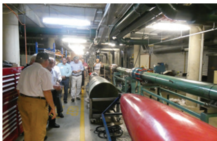
Members examining the X3 Expansion Tunnel.