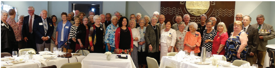
The happy group at the luncheon