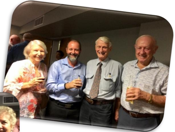
Members of the Association enjoying the AGM