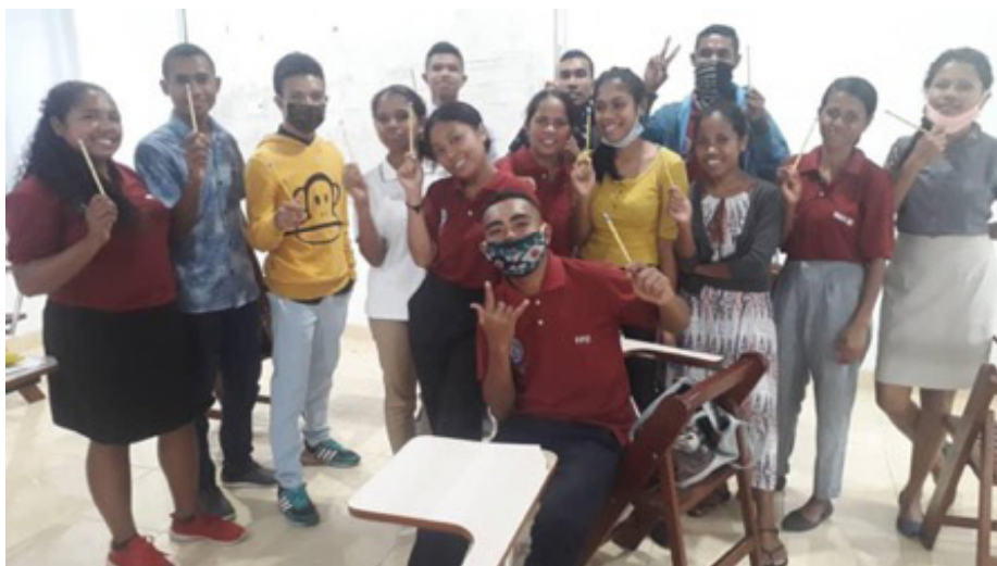
Future English teachers at ICFP in Baucau E.Timor, during COVID-19

Communications & Community Liaison NSW Branch