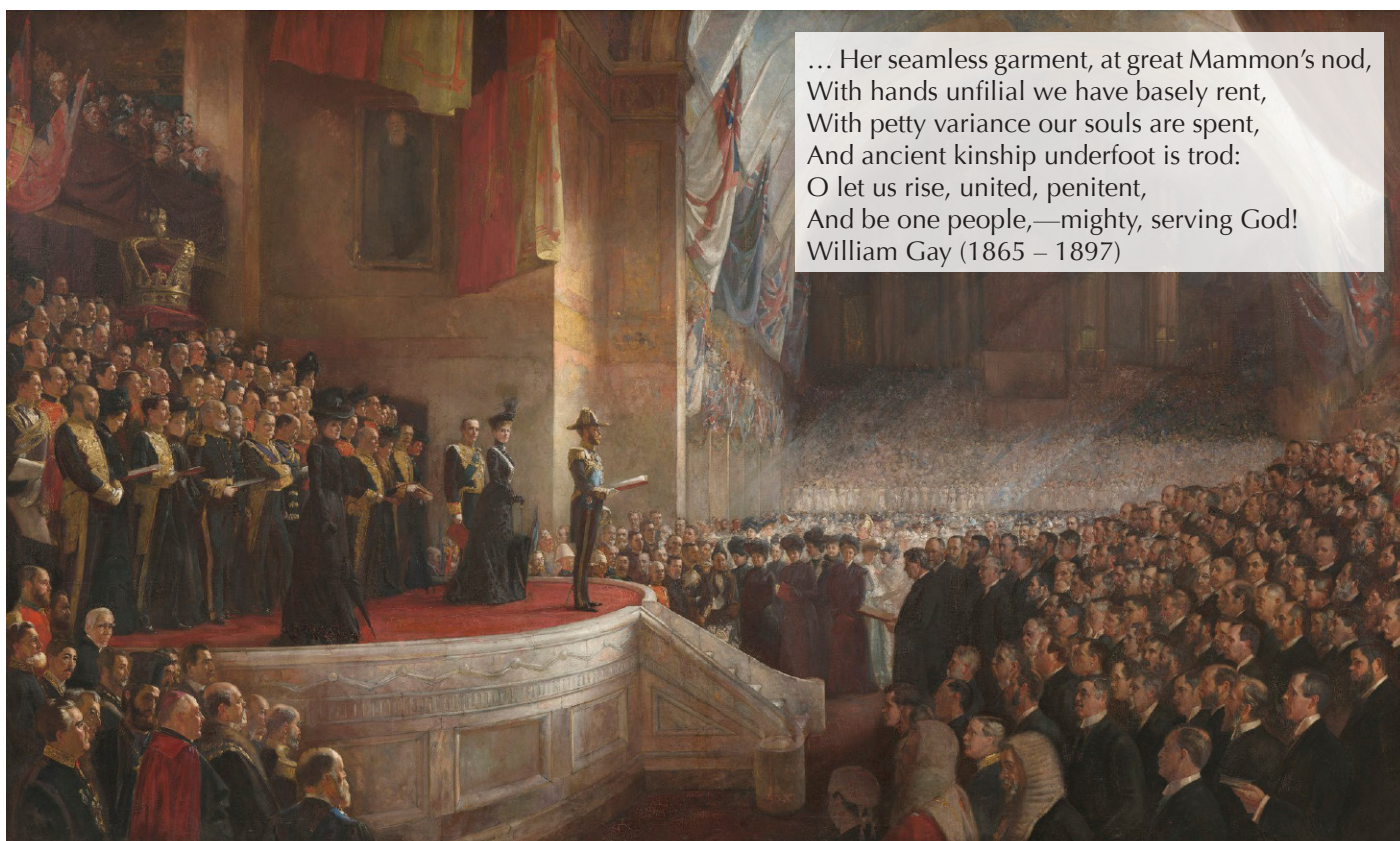
Tom Roberts (1856–1931) Opening of the First Parliament of the Commonwealth of Australia by H.R.H. The Duke of Cornwall and York (Later King George V), May 9, 1901, 1903, oil on canvas. On permanent loan to the Parliament of Australia from the British Royal Collection.