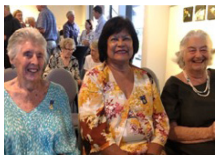
Members at our social function – October 2020