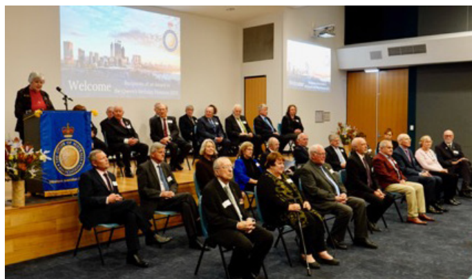
Queen's Birthday 2020 Awardees