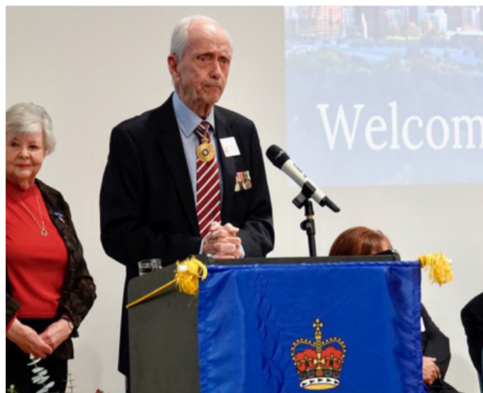
Our National Chairman addresses the gathering

We extend our thoughts to fellow members in other states who are experiencing much more severe restrictions and hope they will soon be through this very difficult time.