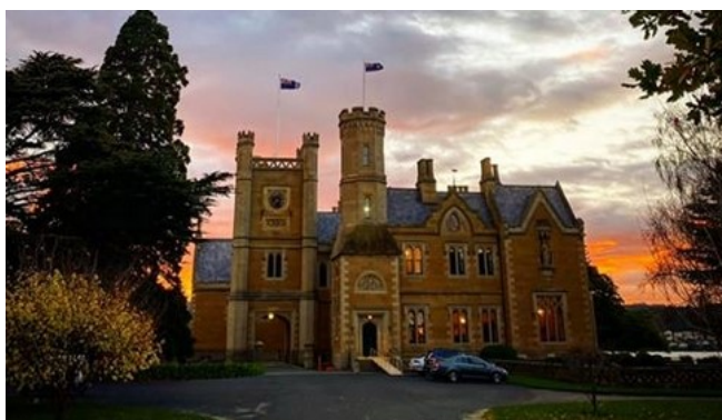
Government House, Hobart

It was in October that the 2020 awardees from both Australia Day and the Queen's Birthday Honours Lists were presented with their insignia