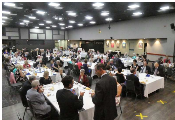
Two images of the gathering of 171 guests at the lunch