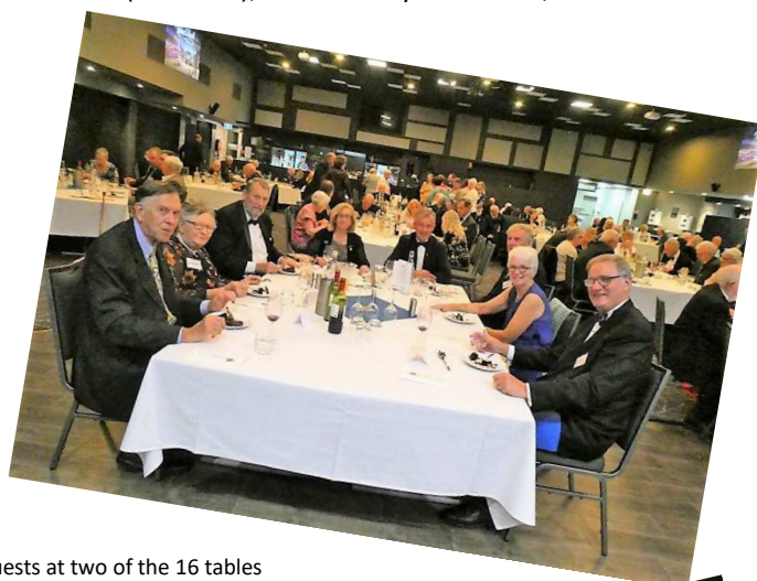
Guests at two of the 16 tables that filled the Blue Pacific Room are enjoying great fellowship.

Georgie's talk on the night demonstrated her passionate love of country. It was sprinkled with beautiful extracts of Australian poetry and included interesting PowerPoint slides of pleasing rural scenery.