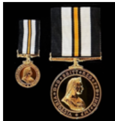
The Ultra-Long Service Medal of the Order of St John recognises 50 years of voluntary service with St John Ambulance, with Service Bars awarded for each additional 5 years' service.