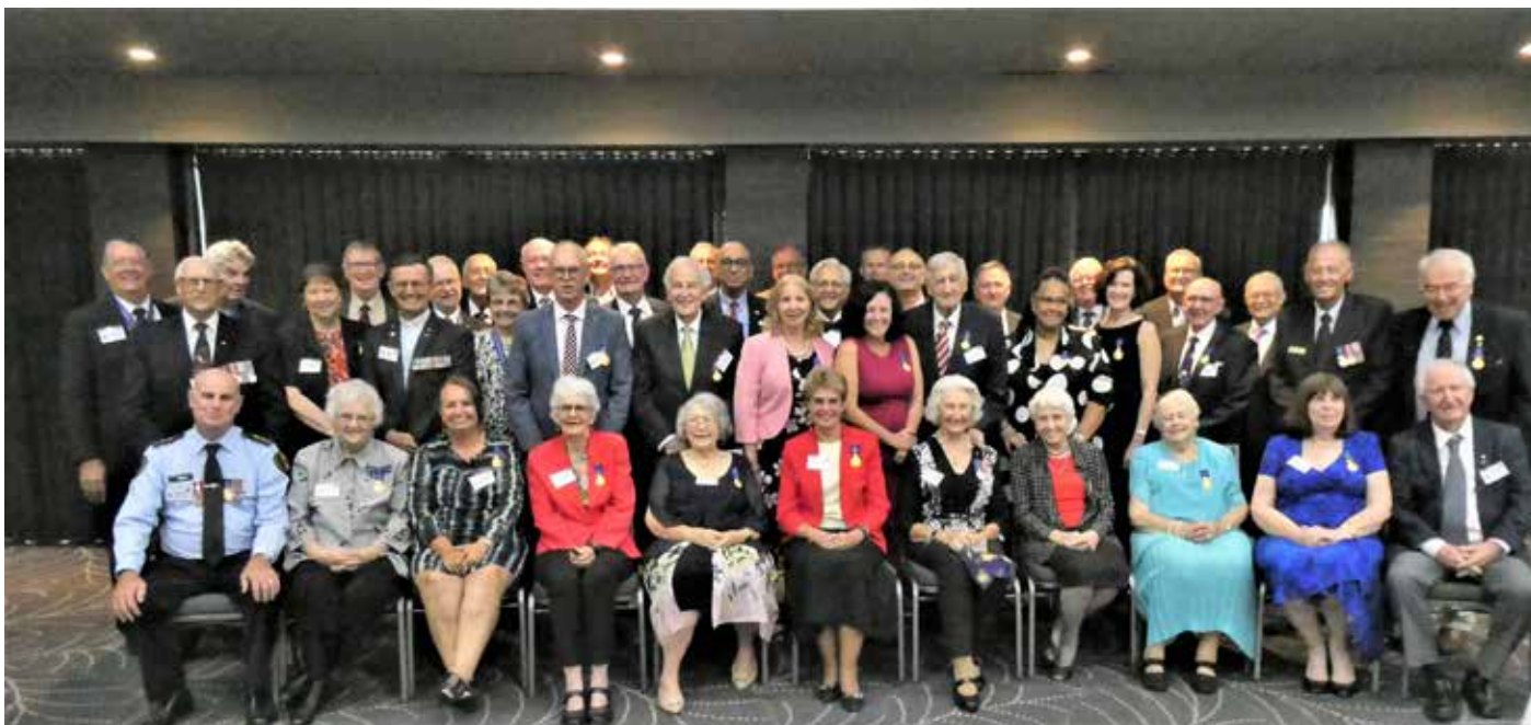
A magnificent parade of outstanding Queenslanders – Forty-three of the forty-seven 2020 award recipients who attended the Welcome Celebratory Lunch on 10 February 2021.

A pleasing turn-out of 171 guests attended the event including a record number of 47 award recipients (26 for Australia Day and 21 from Queen's Birthday). These outstanding Queenslanders represented many fields of endeavour and were celebrated and welcomed in style.