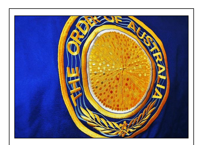
THE SA BRANCH

General information about the SA Branch of the Order of Australia Association can be found here: