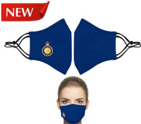
Face mask $25 per pack of 2