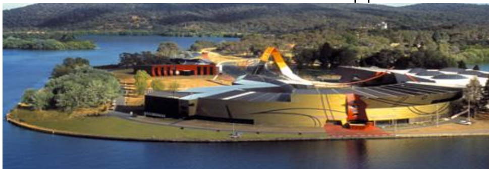
National Museum of Australia

Gala Dinner and OAA Foundation Scholarship presentations