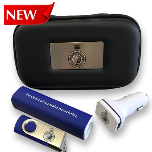
Vista Travel Charger $33 each

OAA Merchandise Shop on-line website www.theorderofaustralia.asn.au/shopping-cart