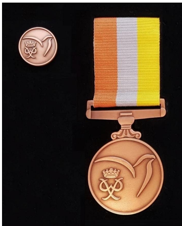
The Long Service Medal of The Duke of Edinburgh's International Award – Australia is accompanied by a lapel pin for everyday wear.