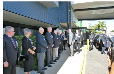
Right – Their Excellencies meet the veterans at the Wall of Remembrance