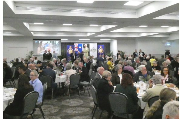
Portion of the 185 guests at the lunch

Governor-General and Her Excellency move to foyer for Official photographs