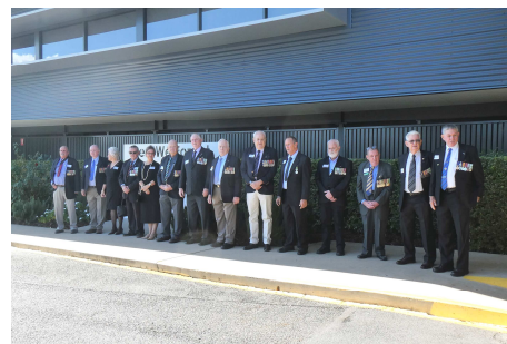
Left – The veterans waiting for arrival of Their Excellencies at the Wall of Remembrance