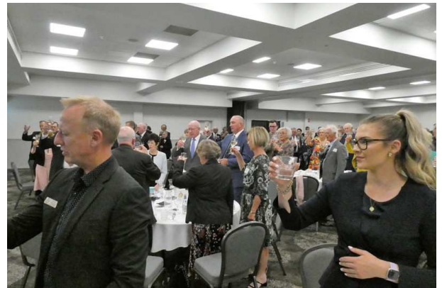
Ladies and Gentlemen please be upstanding and toast the Order of Australia.