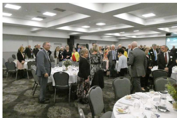
All rise for the arrival of Their Excellencies