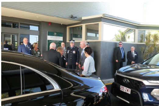
Arrival of Their Excellencies at the entrance to the Frenchville Sports Club.