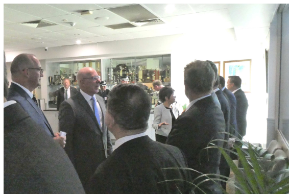
Their Excellencies meet the selected arrival party in the Frenchville Sports Club foyer.