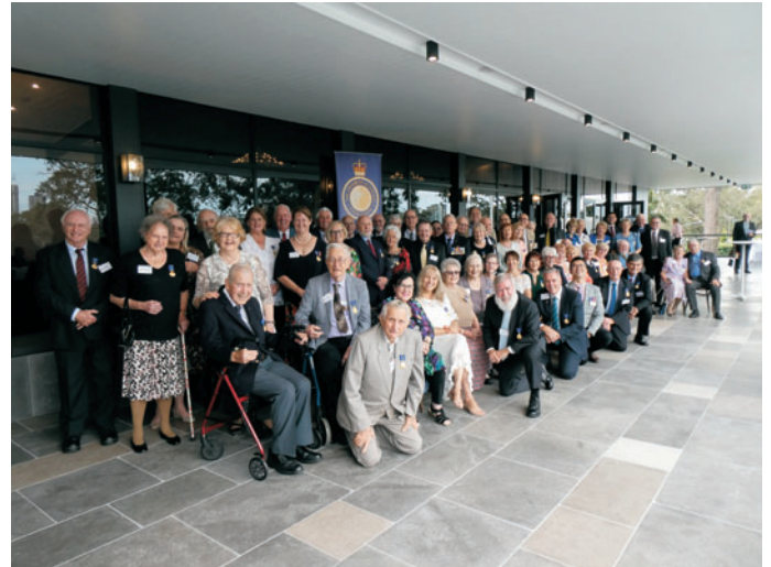
A fine parade of wonderful Queenslanders – Sixty of the sixty-five new award recipients present at the lunch on the Victoria Park verandah.

On Tuesday 26 October 2021, the Queensland Branch hosted a Welcome Celebratory Lunch in the Ballroom of Victoria Park at Herston, Brisbane for 2021 Australia Day and Queen's Birthday award recipients.