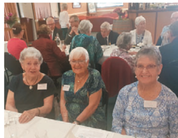
Great Southern Members enjoying their lunch

The visit to Albany to join with Great Southern region members for their Church parade and lunch is, for many Perth members, a much anticipated annual event. The Church parade is held in several different Churches and this year was held in the Holy Family Catholic Church in Albany. Following the service 33 members and guests enjoyed a Christmas lunch at Motel le