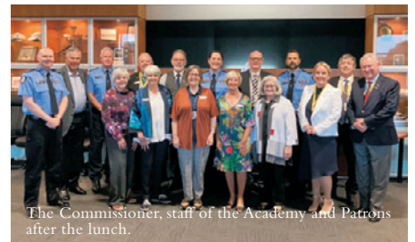
The Commissioner, staff of the Academy and Patrons after the lunch.

There is a plan to provide a Patron for the Indigenous Cadet program which the Academy is hoping will have a late January or early February start