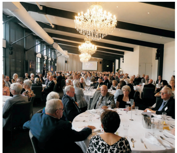
The Ballroom looked a real treat with the colourful array of 24 tables all filled with guests enjoying the festivities.

We also had our second-best overall attendance ever with 238 guests attending and it was pleasing that there were 41 Association members (who were not new awardees) also present. The Ballroom looked a real treat with the colourful array of 24 tables all filled with guests enjoying the festivities.