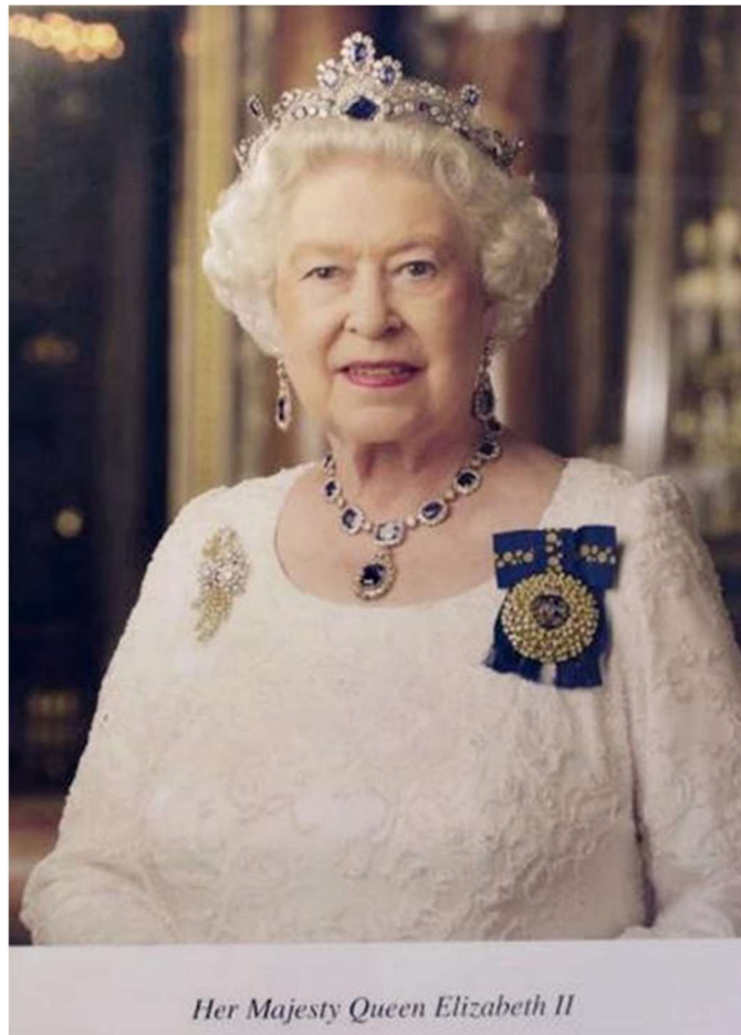
Her Majesty Queen Elizabeth II

Firstly, in 2022 we acknowledge that Her Majesty will celebrate 70 years as Queen. What an unsurpassed memorable record of service to her peoples and the wider Commonwealth of nations. I share with you my favourite portrait (it never got included in The Order magazine). It is so apt for our Association as the Order of Australia award motifs are balanced with an Australian wattle brooch. In 1975 Her Majesty gave royal ascent to the establishment of the unique system of Australian honours. Since then Australians from all walks of life have been recognised with an Order of Australia award by their countrymen as possessing those personal and community based attributes worthy of recognition. Even so, only about one person in 1100 has been so recognised. Awardees are indeed special and rare Australians.