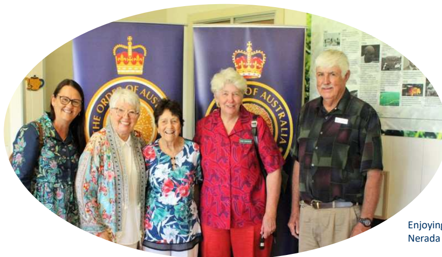
Enjoying the informality at the Nerada Tea Plantation