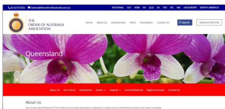
Above: Queensland Branch Homepage at https://theorderofaustralia.asn.au/queensland/about-us/

I urge members to make it a habit to visit our website from time to time at http://theorderofaustralia.asn.au to keep up to date with what is happening in the Association, particularly national matters.