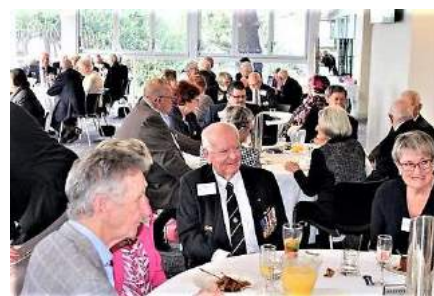
Portion of the 62 guests enjoy good fellowship at the Alex Surf Club.