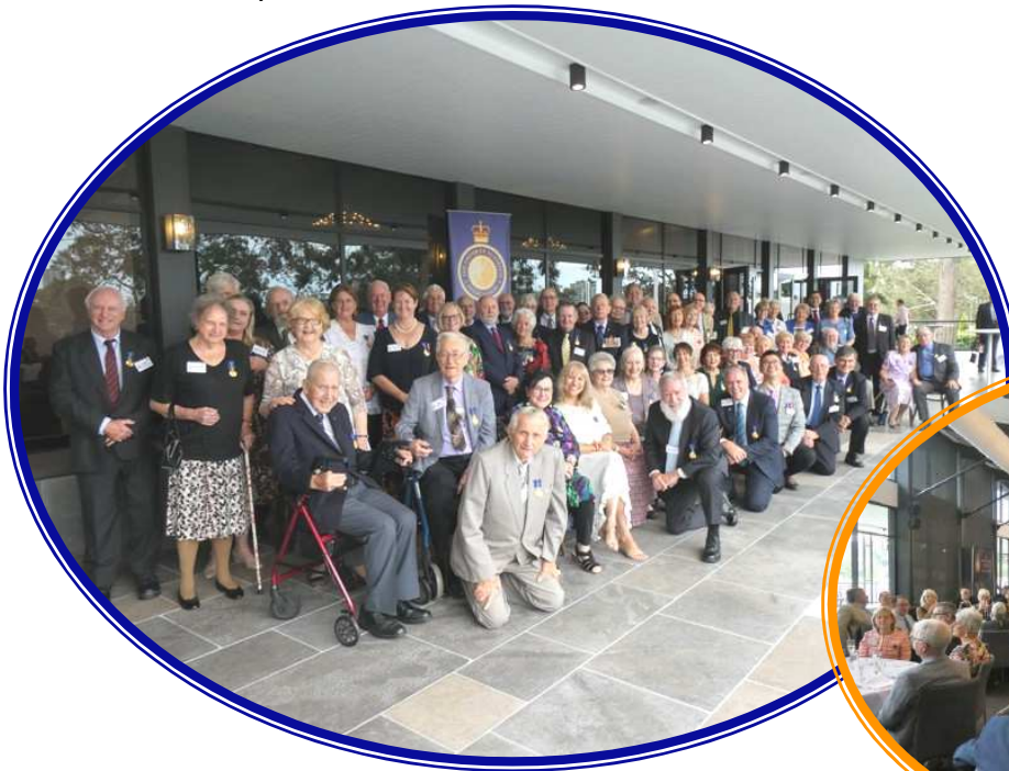
Photo left – New award recipients on parade at the Welcome Celebratory Lunch on the Victoria Park verandah.

A record number of 65 new award recipients (22 from Australia Day and 43 from Queen's Birthday) attended the event, eclipsing the previous record of 47 recipients at the February 2021 lunch.