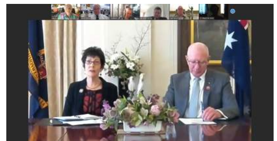
Her Excellency Mrs Linda Hurley concluded the meeting with a song with His Excellency the Governor-General listening with great admiration.

Despite the effects of the Covid 19 pandemic continuing in 2021, the Queensland Branch maintained a healthy uptake of new award recipients taking out membership of the Association. This aspect will be reported in greater detail later in this report as item 10 on page 21. Suffice to say that the membership uptake of the 2021 Australia Day award recipients and the 2021 Queen’s Birthday award recipients were 33 out of 83 recipients (39.8%) and 59 out of 122 recipients (48.4%) respectively.