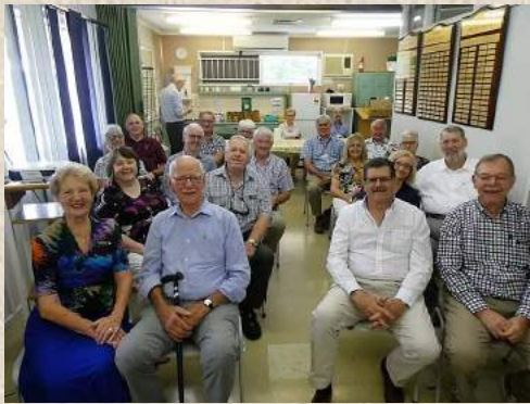
"School's in" – The Queensland Branch Committee members and their spouses enjoy the presentation " How do I trace my family history " at the Queensland Family History Society visit.