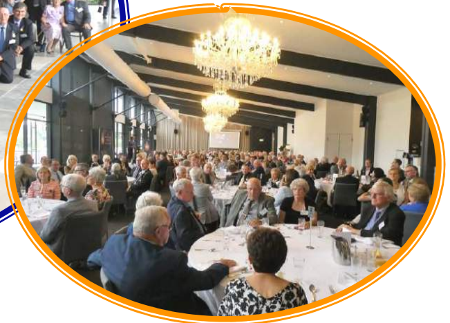
Photo below – A Bumper crowd of 238 guests fill the Victoria Park Ballroom at the lunch on 26 October 2021.

We also had our second best overall attendance ever with 238 guests attending and it was pleasing that there were 41 Association members (who were not new awardees) also present. The Ballroom looked a real treat with the colourful array of 24 tables all filled with guests enjoying the festivities.