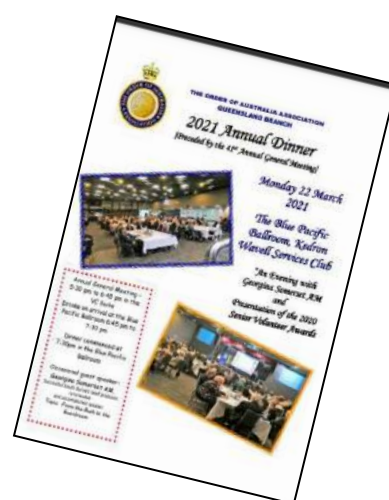
Right: The website contains a range of pictorial highlights of past events – this is page 1 of the 2021 Annual Dinner highlights