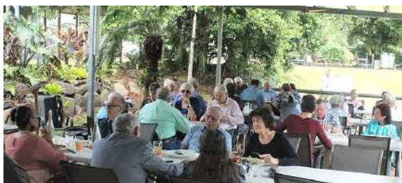
The 29 guests enjoy a wonderful atmosphere at the Mountain view Hotel.

The Far North Queensland Regional Group organized an entertaining lunch at the historic Mountain View Hotel at Little Mulgrave, 34 kilometres south of Cairns. There were 29 guests present.