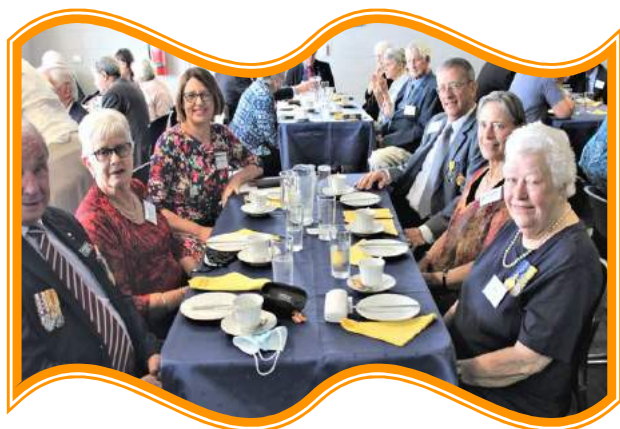
Some of the faces at the Sunshine Coast Lunch at Bribie Island