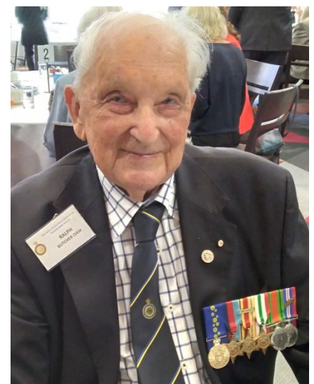
Couple of tables of members and guests at the lunch