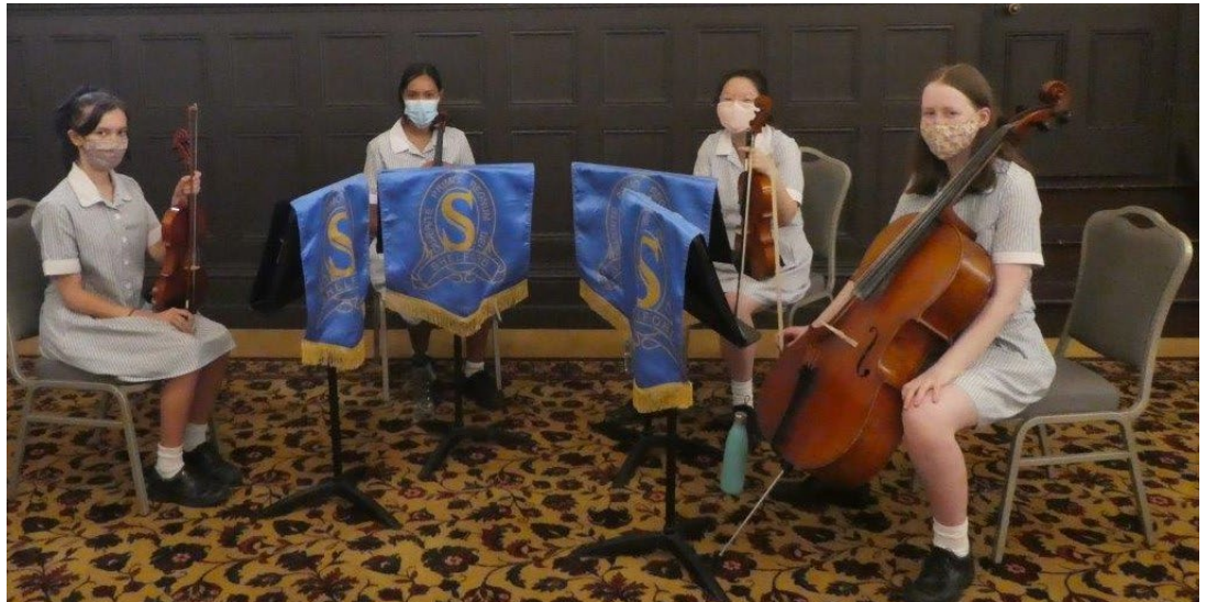
Shelford Girl's Grammar string quartet

The VIC Branch appreciates the support we received from the staff at the Melbourne Town Hall regarding the set-up, catering and audio; plus a grant toward the event cost.