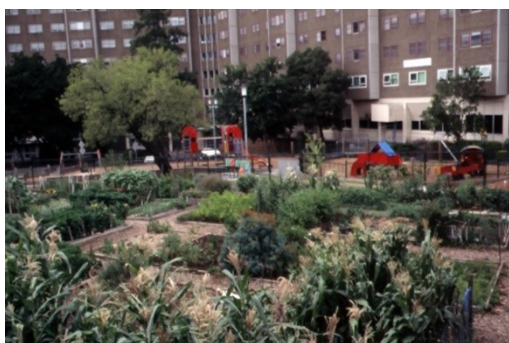
Photo: General view of Alfred Street, North Melbourne Community Garden with the children's playground in the background.

The gardens greatly assist emotional and mental wellbeing. It has been well documented gardening provides many benefits including social interaction and the joy of planting, and seeing produce growing, flowering and ripening, becomes something to live for, and to learn to laugh again.