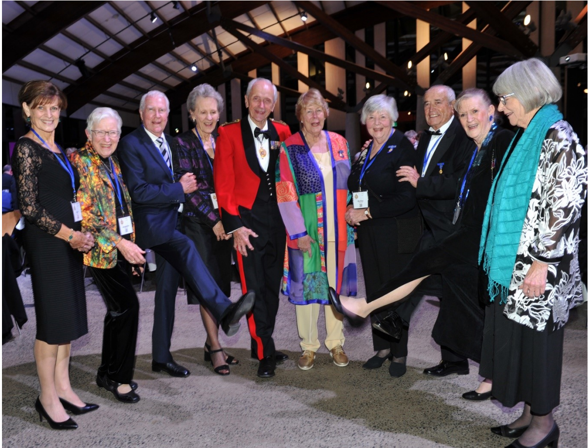
A number of the Western Australian Delegates at the Dinner.

Eleven Western Australians attended the Conference from 19 – 22 May. It was a very enjoyable meeting with renewal of friendships from previous Conferences and meeting interstate members from all around Australia with their amazing contributions to our country and the world.