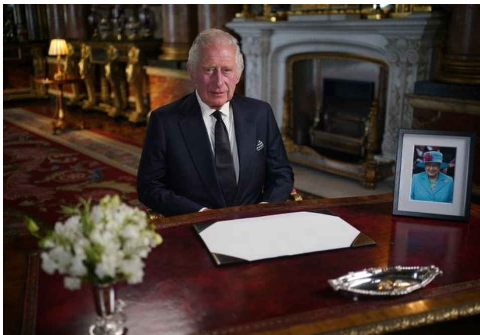
His Majesty King Charles III – The Sovereign of The Order of Australia