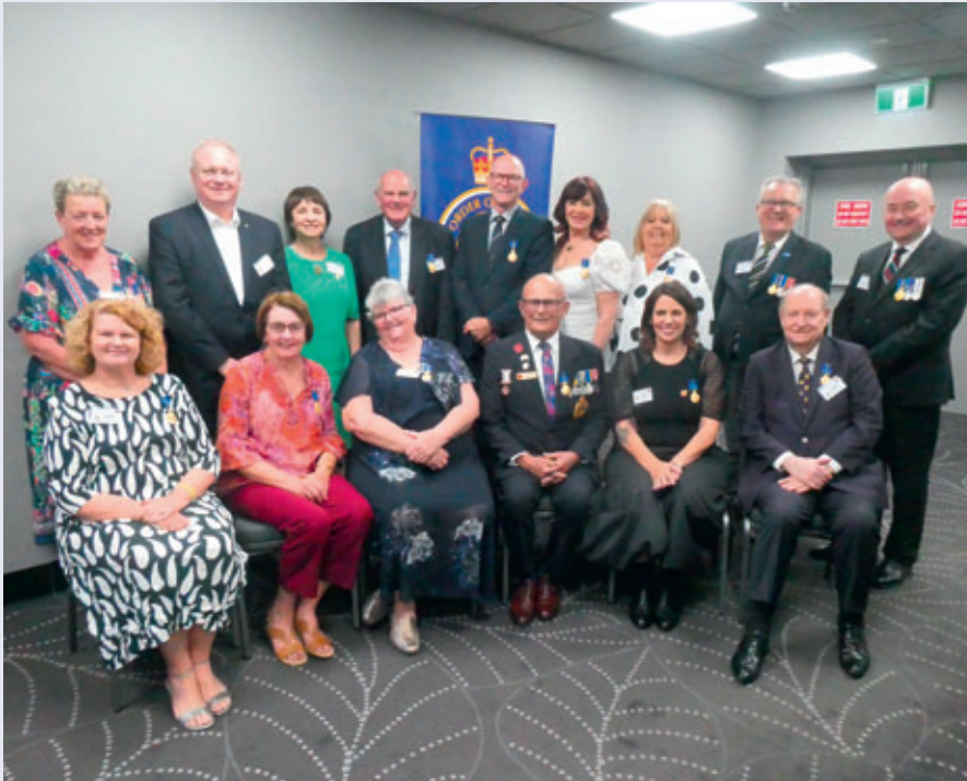
The photo shows the award recipient present and their citations.

On Wednesday 23 November 2022, the Queensland Branch hosted a Welcome Celebratory Lunch in the Blue Pacific Ballroom at Kedron Wavell Services Club, Chermside, for 2022 Queen's Birthday award recipients.