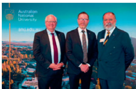
ANU Vice-Chancellor, Professor Brian Schmidt AC, Professor Rory Medcalf AM, Michael Crane DSC & Bar AM