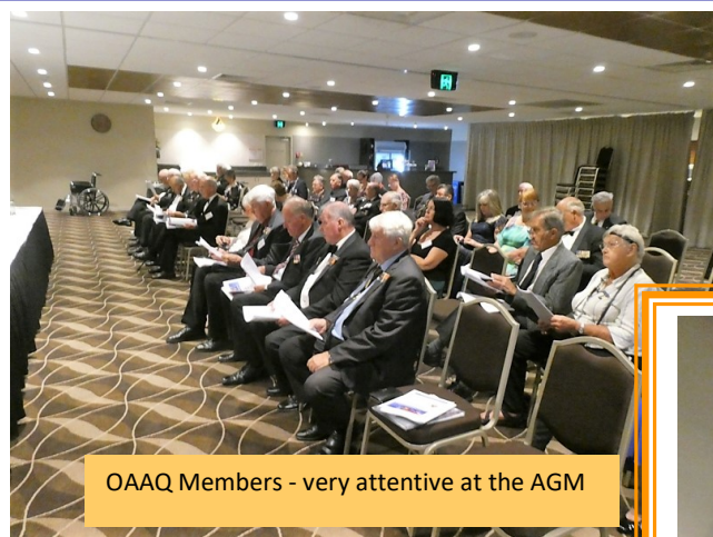
OAAQ Members - very attentive at the AGM