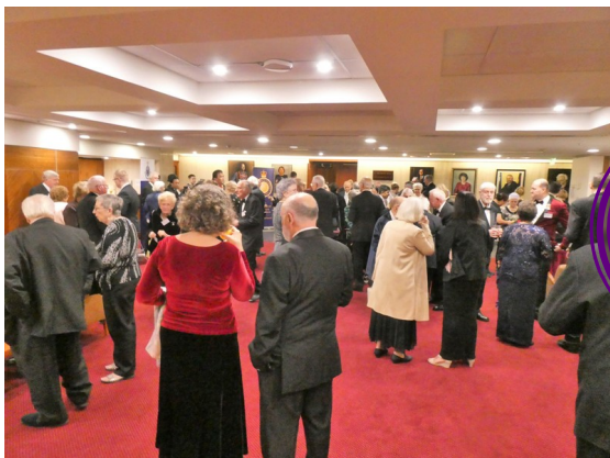
Enjoying pre dinner drinks in the Premiers' Hall foyer.