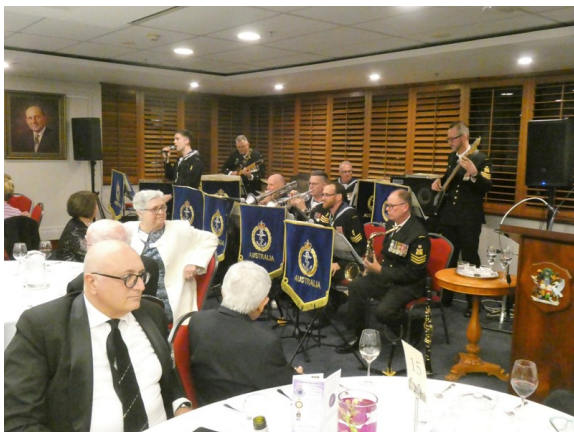
During the evening guests were entertained with music delivered by the Royal Australian Navy Jazz Ensemble.