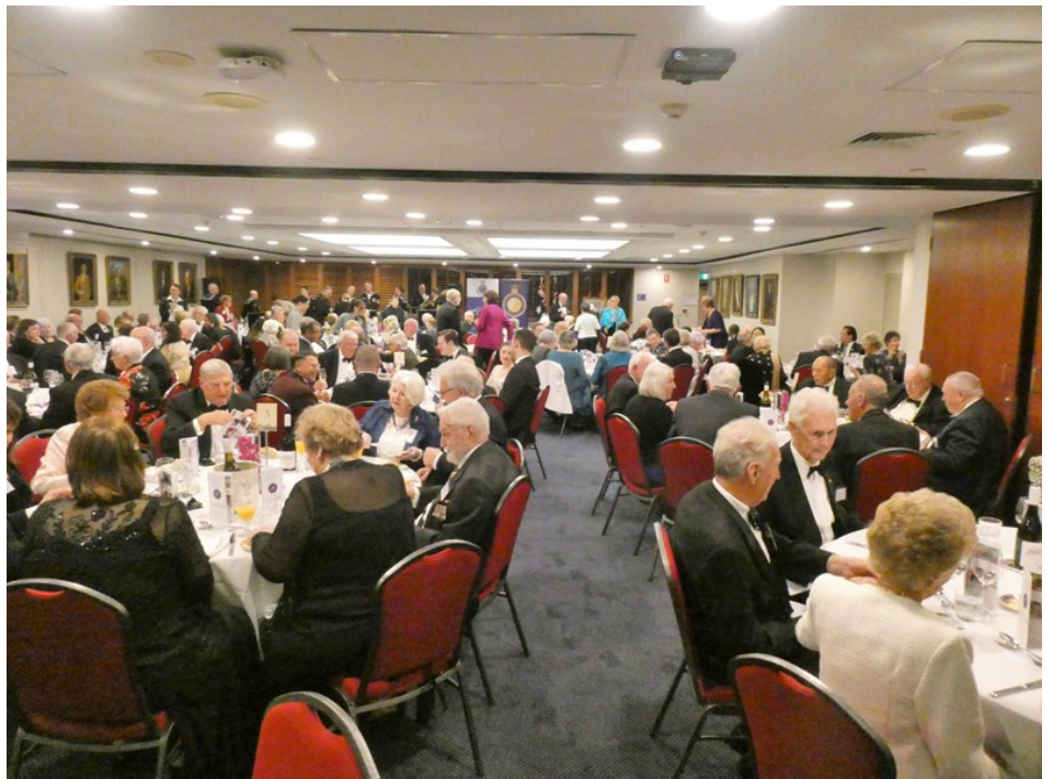
A great atmosphere at the Queen's Jubilee Dinner at Parliament House.