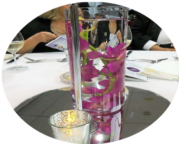
Kathy Wooldridge OAM provided a neat floral decoration for each table