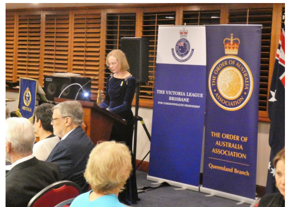
Her Excellency, the Governor of Queensland addresses the gathering.