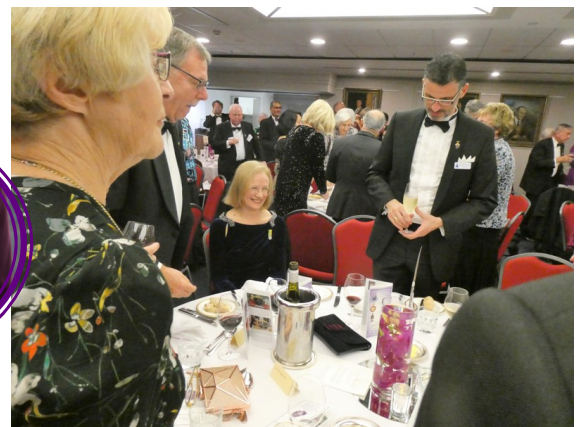
All guests were upstanding for the Toast to Her Excellency, the Governor of Queensland.