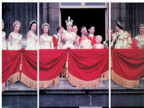
The Coronation of Queen Elizabeth II in Westminster Abbey June 2, 1953.

Alfred the Great 886-899 Edward the Elder 899-924 Athelstan 924-939 Edward 939-946 Edmund 946-955 Edward 955-959 Edgar 959-975 Edward the Martyr 975-978 Ethelred I the Unready 978-1016 Edmund Ironside 1016 Cnut 1016-1035 Harold I Hardknott 1037-1040 Harthacnut 1040-1042 Edward the Confessor 1042-1066 Harold II 1066 William I (the Conqueror) 1066-1087 (King of England) William II 1087-1100 Henry I 1100-1135 Stephen 1135-1154 Henry II 1154-1189 Richard I (the Lionheart) 1189-1199 John 1199-1216 Henry III 1216-1272 Edward I 1272-1307 Edward II 1307-1327 Edward III 1327-1377 Richard II 1377-1399 Henry IV 1399-1413 Henry V 1413-1422 Henry VI 1422-1461; 1470-1471 Edward IV 1461-1470; 1471-1483 Edward V 1483 Richard III 1483-1485 Henry VII 1485-1509