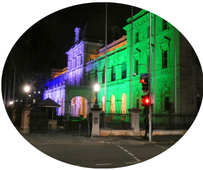
Parliament House just happened to be specially lit up on the night of the Dinner.