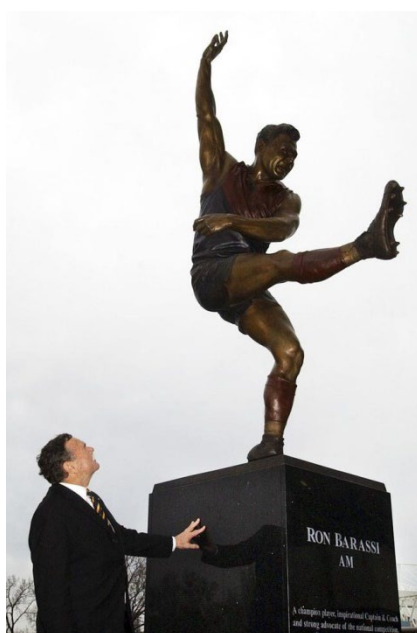
Ron Barassi AM immortalised in bronze In a statue at the MCG in 2003

On the night of Ron's passing a moment of silence was held before Port Adelaide's clash with GWS at Adelaide Oval, fans remained extremely respectful and didn't call out. Appropriate respect for a man widely revered and loved.