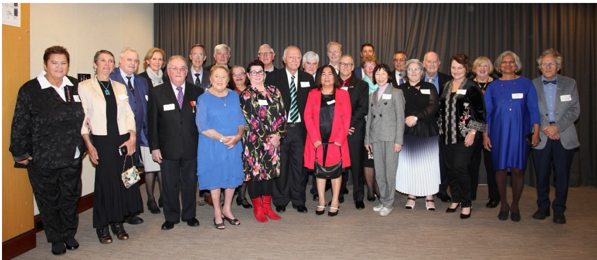
The King's Birthday Honours Recipients 2023