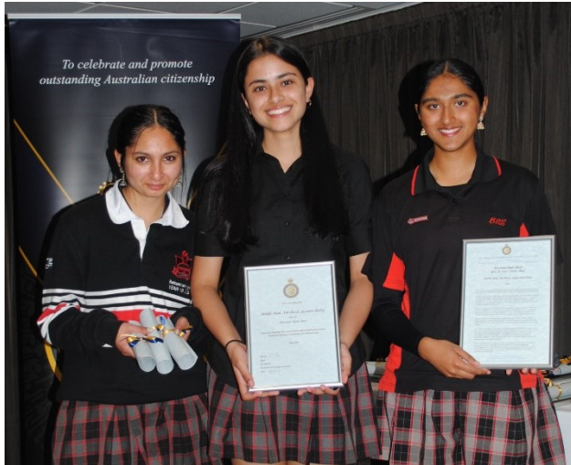
Belconnen High School Year 10

have sought safety in Australia from persecution, torture and war related trauma.