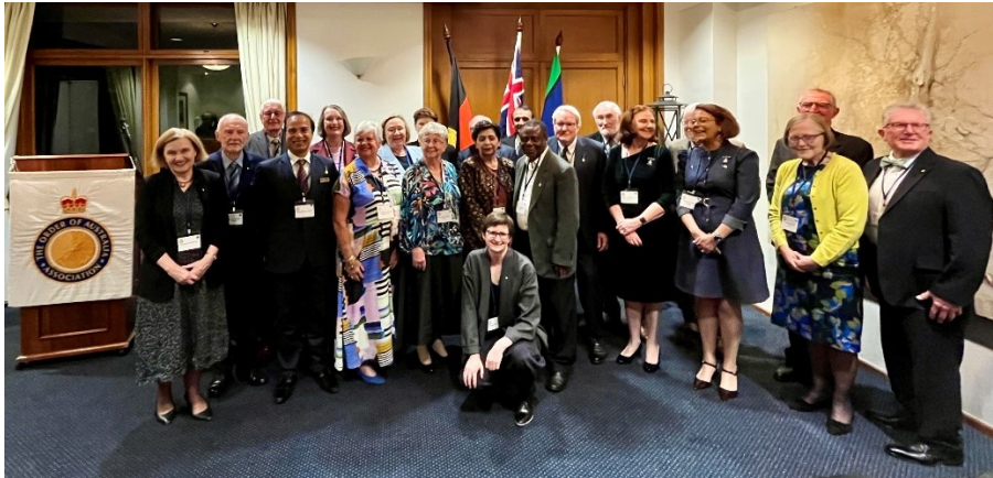
Kings Birthday reception – New recipients