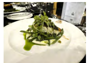
Crispy skin barramundi