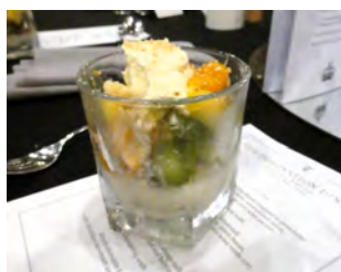
Coconut, lime and mango trifle