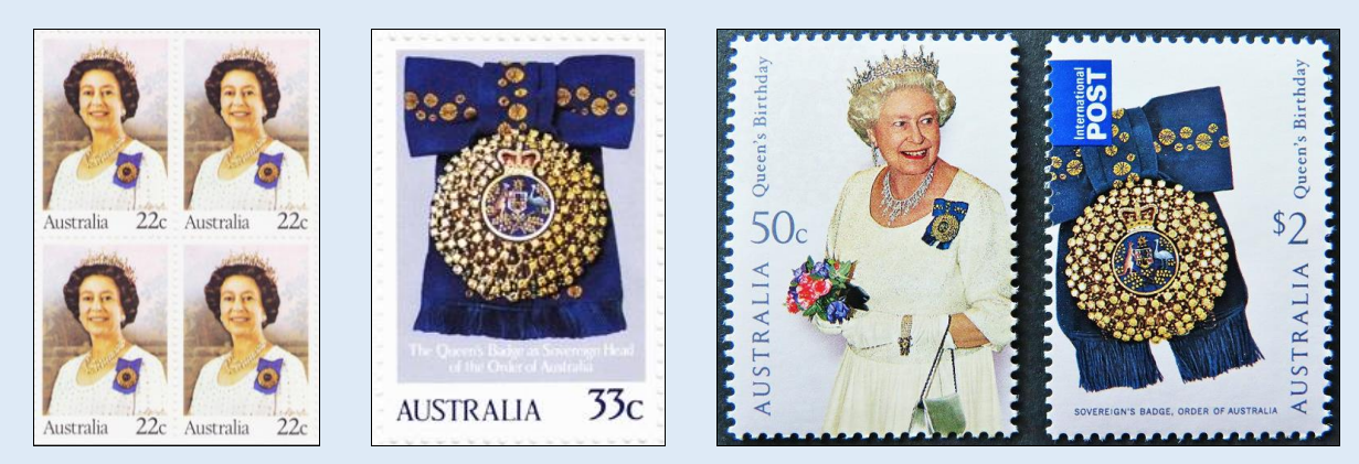
The Insignia of the Sovereign of the Order of Australia depicted on Australian 22 cent postage stamps (Queen's Birthday 1980), a 33 cent stamp (Queen's Birthday 1985) and postage stamps issued for the 2008 Queen's Birthday.

Since 1 February 1989, the Governor-General has been Chancellor of the Order, while the Official Secretary to the Governor-General is Secretary of the Order.