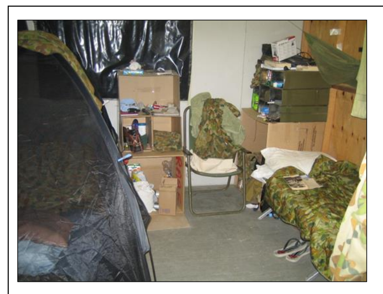
Living conditions in Dili.