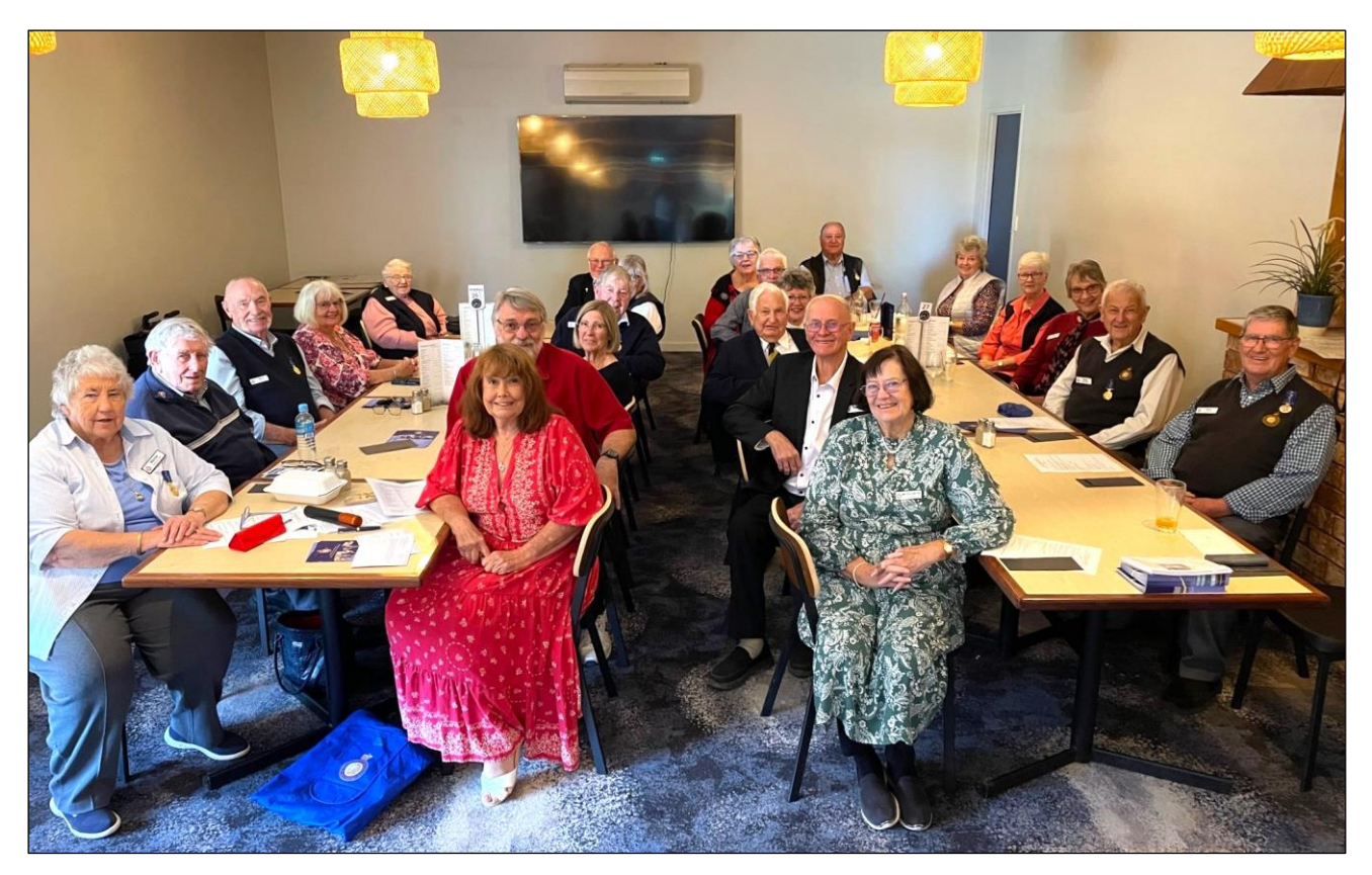
Members of the Yorke Peninsula Regional Group in Ardrossan on Sunday 28 April.