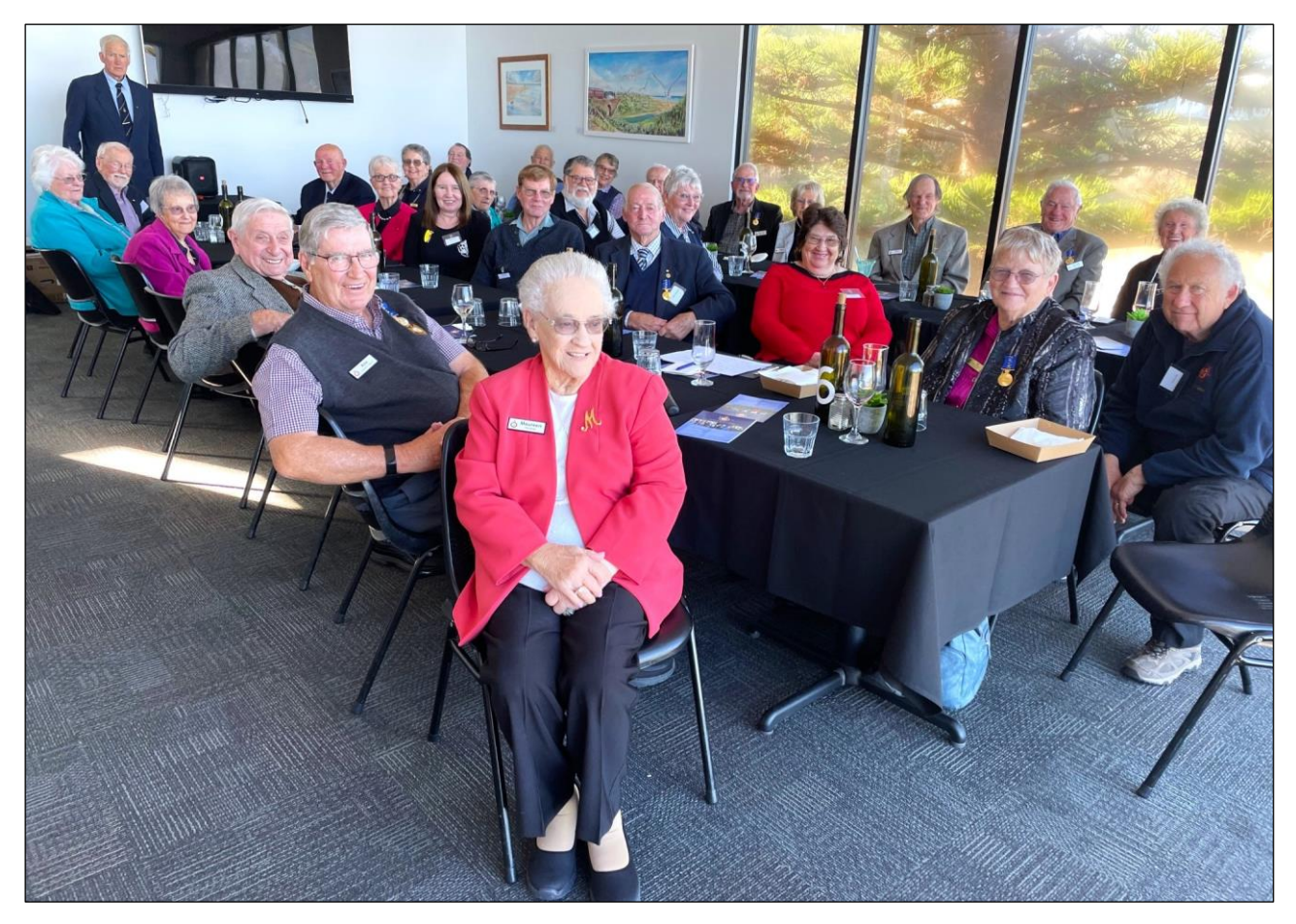
Members of the Fleurieu Regional Group at Chiton Rocks on Friday 3 May.