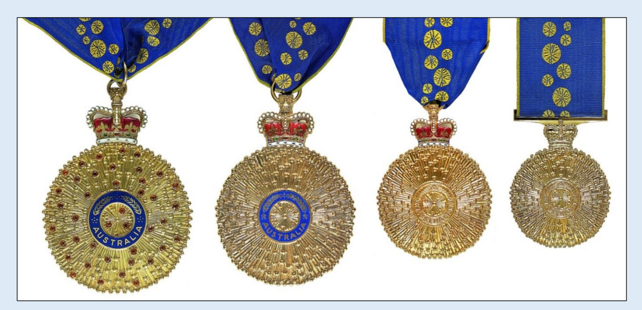
Insignia in the Military Division are denoted by gold edges 1.5 mm in width on the suspension ribbon: pictured above – Companion (AC), Officer (AO), Member (AM) and the Medal of the Order of Australia (OAM).

The Order may be awarded in either the General Division or the Military Division. When the Order was originally created in 1975, it comprised a Civil Division and a Military Division – following the precedent of the Order of the British Empire. The former was retitled 'General Division' under Letters Patent dated 24 May 1976. The General Division is senior to the Military Division.