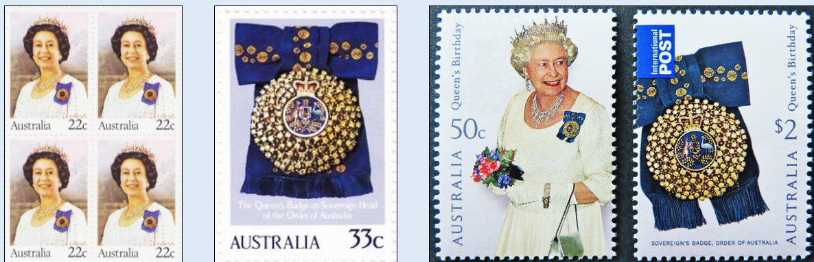
The Insignia of the Sovereign of the Order of Australia depicted on Australian 22 cent postage stamps (Queen's Birthday 1980), a 33 cent stamp (Queen's Birthday 1985) and postage stamps issued for the 2008 Queen's Birthday.

Since 1 February 1989, the Governor-General has been Chancellor of the Order, while the Official Secretary to the Governor-General is Secretary of the Order.