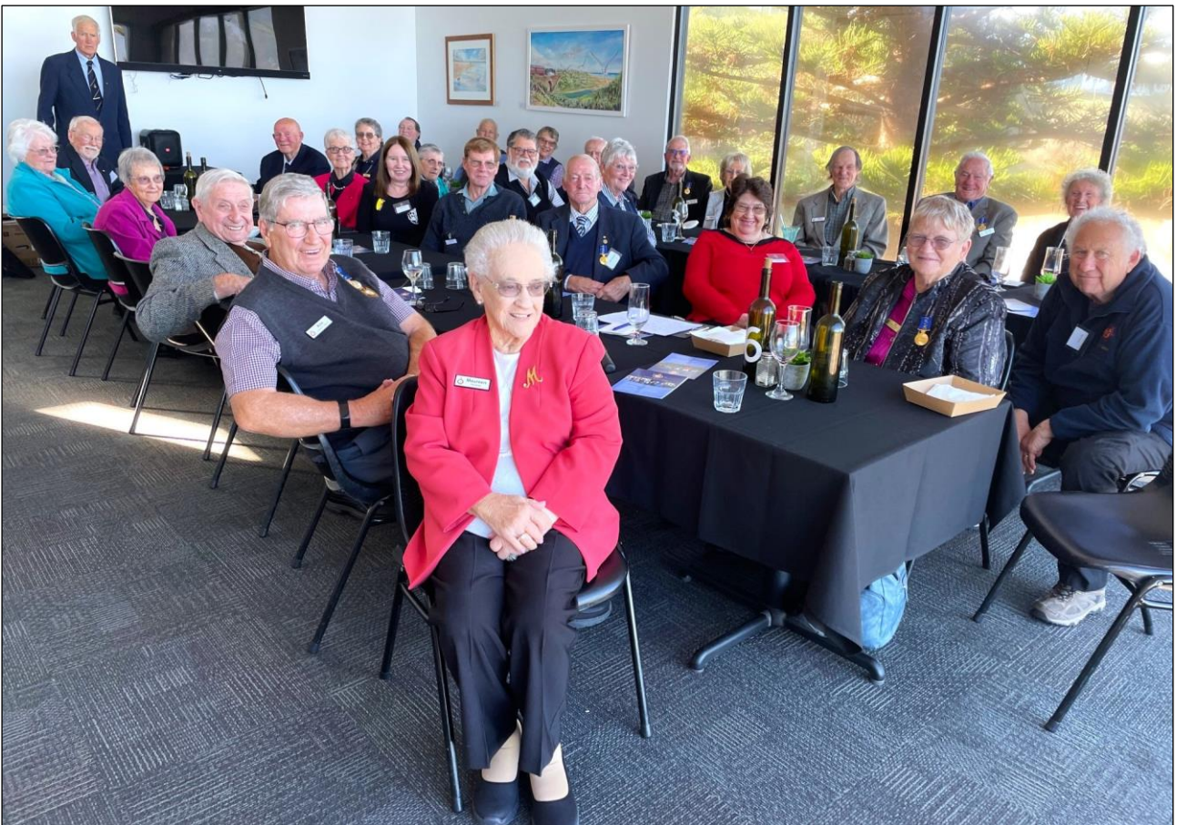
Members of the Fleurieu Regional Group at Chiton Rocks on Friday 3 May.