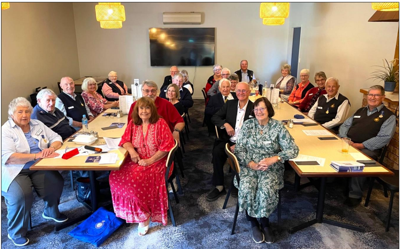
Members of the Yorke Peninsula Regional Group in Ardrossan on Sunday 28 April.