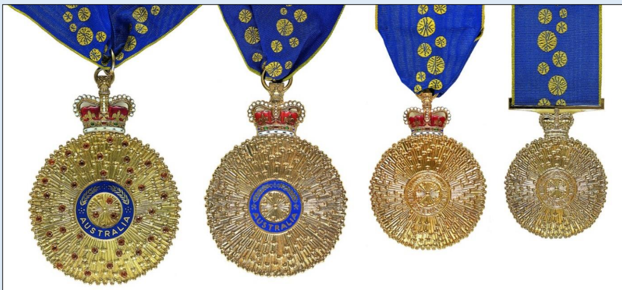
Insignia in the Military Division are denoted by gold edges 1.5 mm in width on the suspension ribbon: pictured above – Companion (AC), Officer (AO), Member (AM) and the Medal of the Order of Australia (OAM).

The Order may be awarded in either the General Division or the Military Division. When the Order was originally created in 1975, it comprised a Civil Division and a Military Division – following the precedent of the Order of the British Empire. The former was retitled ‘General Division’ under Letters Patent dated 24 May 1976. The General Division is senior to the Military Division.