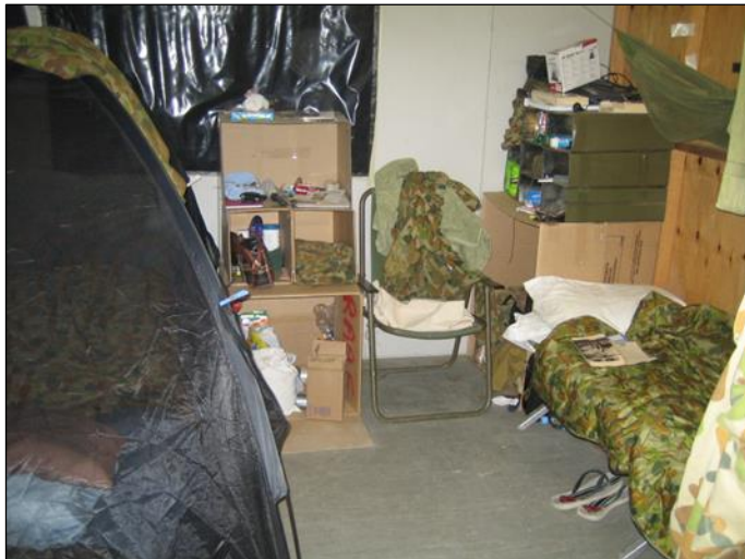
Living conditions in Dili.