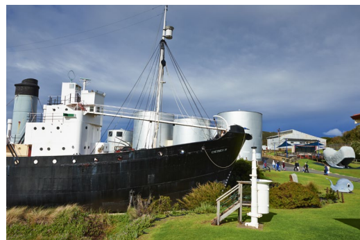
Albany's Historic Whaling Station