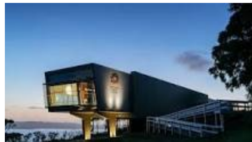
National Anzac Centre, Albany