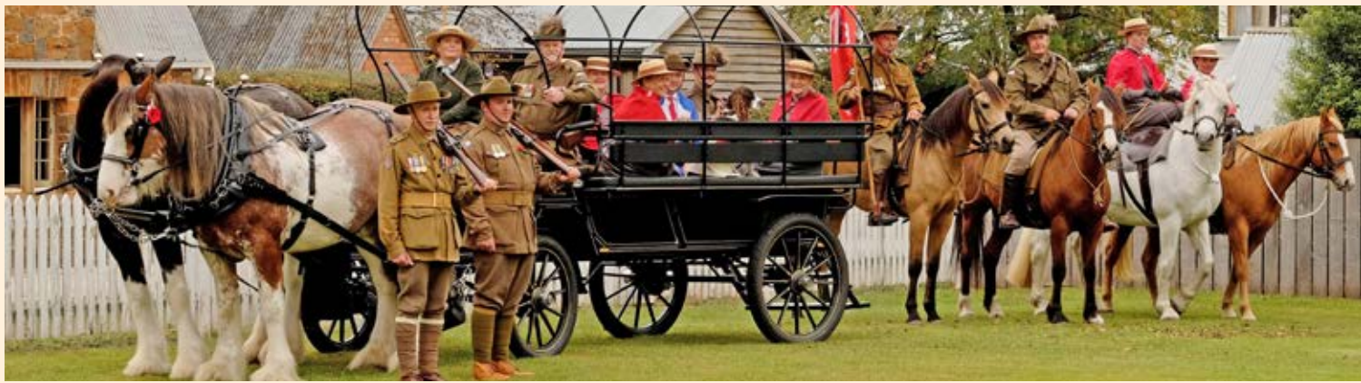
The Northern Tasmanian Light Horse Presentation at the 2022 Anzac Day Service and Parade at Campbell Town