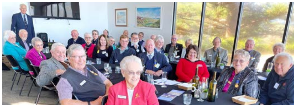
Fleurieu Regional Group members at Chiton Rocks, Friday 3 May