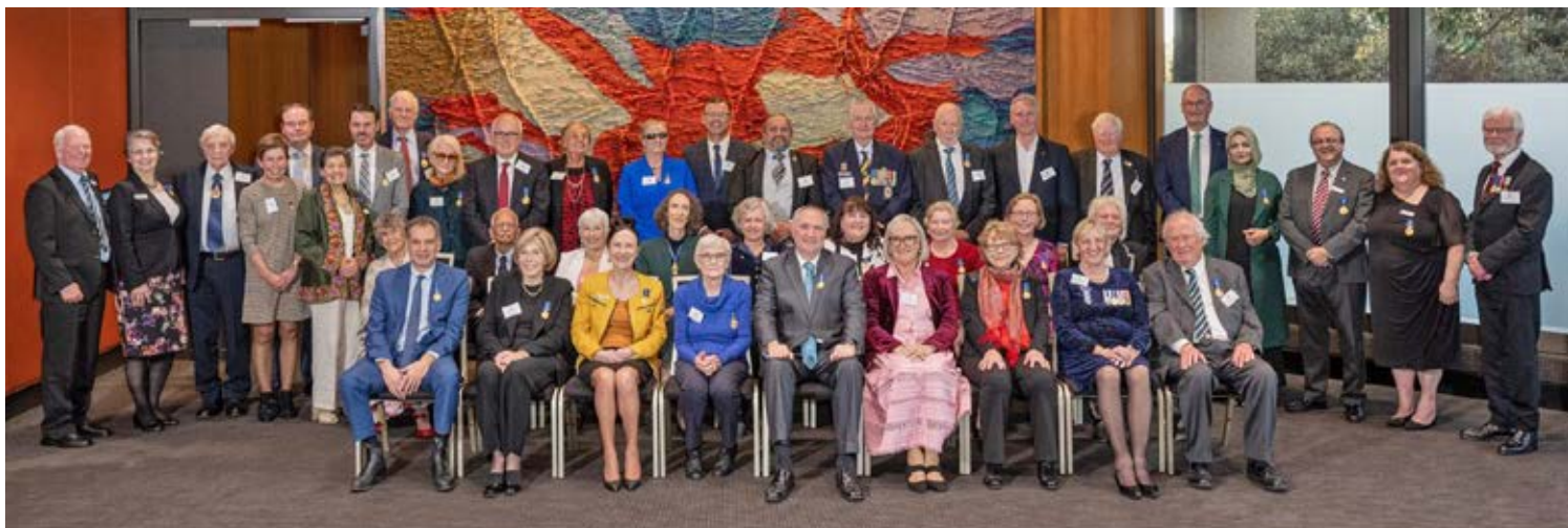
Australia Day 2024 recipients and the NSW Branch Committee