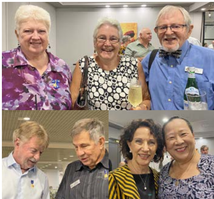
Guests at the NT Branch Annual Dinner