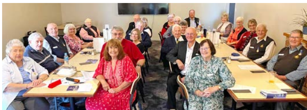
Yorke Peninsula Regional Group members in Ardrossan, Sunday 28 April