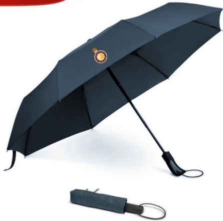
Compact 53cm umbrella Navy Compact auto opening & closing $30