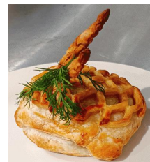
Photo: Beef Wellington

Antipasto Placcata - Apple Amber – Gnocchi - Beef Wellington - Bruschetta - Cherry Frangipane - Vegetable Pilau - Cock-a-leekie Soup - Cream Caramel - Duck Cacciatore - Eton Mess - Fish Véronique - Fondant Potato - Fresh Linguine - Linguine - Chicken Galantine - Salmon Pave - Iced Christmas Pudding - Beef Wellington - Madras Curry - Mango Pudding - Lamb Ossobuco - Mulligatawny - Pork Vindaloo – Poutine - Spring Rolls - Ragù alla Bolognese - Ratatouille - Roast Turkey - Salmon Coulbiac - Seafood Marinara - South African Bobotie Pie - Crispy Pork Belly – Hot Fruit Salad - Strawberry Romanoff - Steak and Kidney Pie - Crab Fritters - Turducken - Risotto – Lasagna - Vichyssoise - Welsh Rarebit.