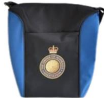
Cooler bag 10L with strap $20