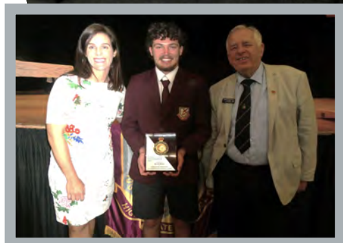
[Taken at the St George State High School 47 th Annual Awards Presentation – 11 November 2024 at St George, 550 km south –west of Brisbane]