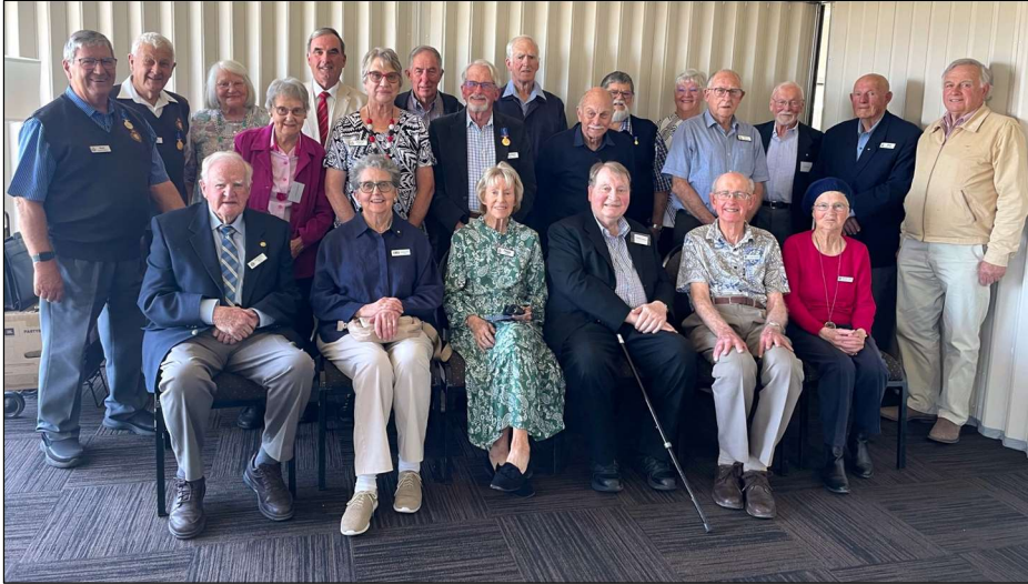
Members and guests of the Fleurieu Regional Group luncheon at the Victor Harbor Golf Club on Friday 1 November.