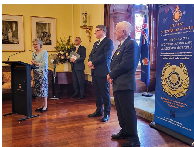
Her Excellency the Honourable Frances Adamson AC

https://theorderofaustralia.asn.au/sa/school-awards/