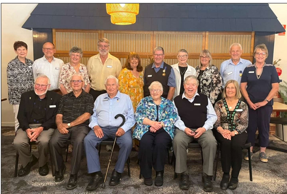
Members and guests of the Yorke Peninsula Regional Group at the Ardrossan Luncheon on Sunday 27 October.