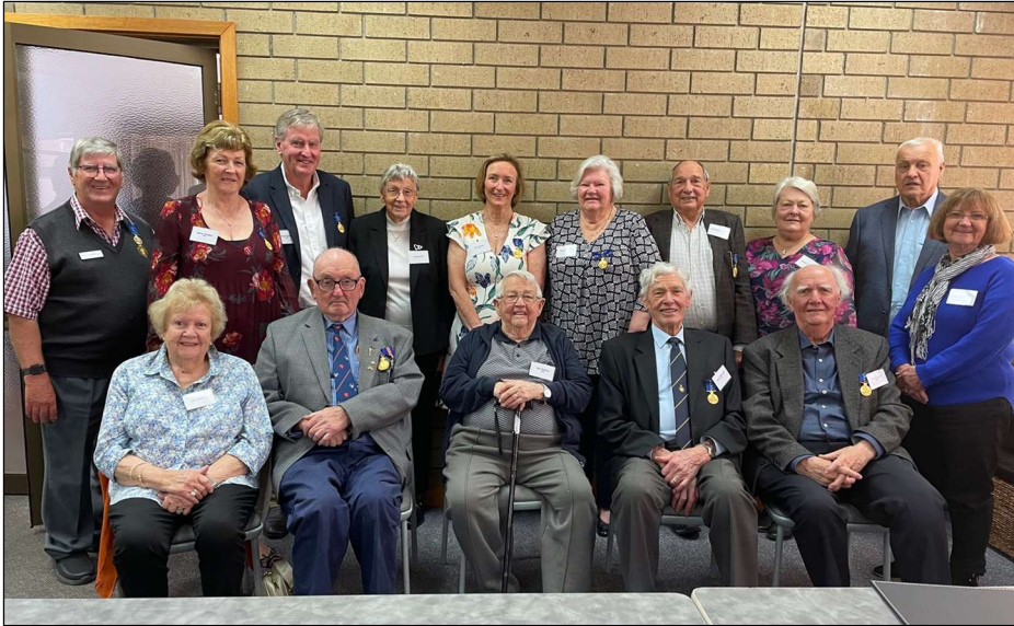
Members and guests of the proposed Eyre Peninsula Regional Group at the Cummins Community Hotel on Friday 11 October.