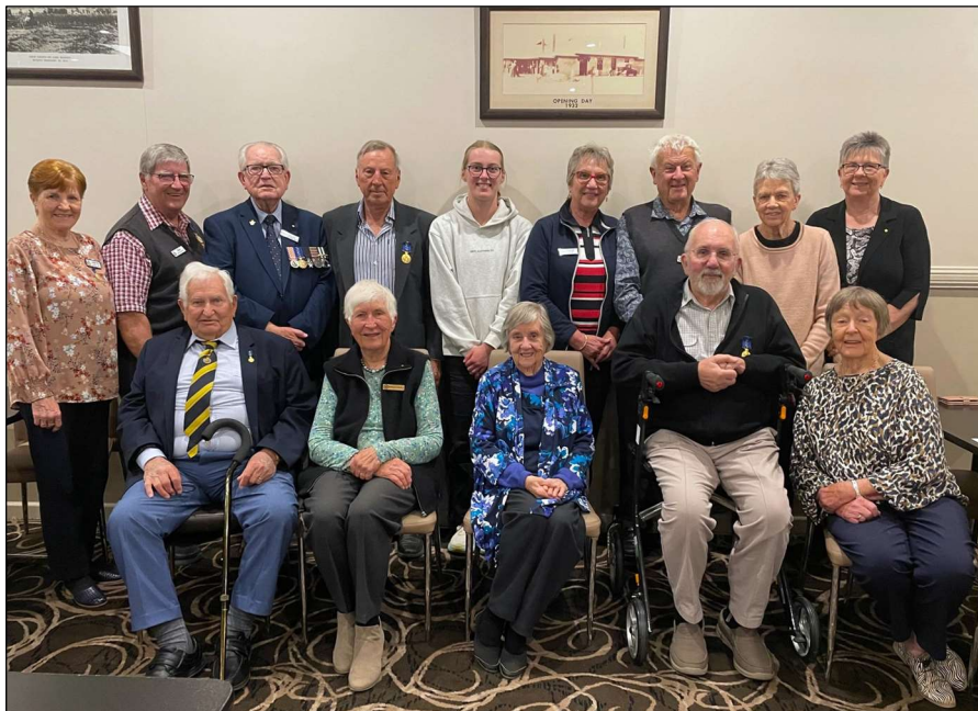
Members and guests of the Riverland and Mallee Regional Group at the Barmera Hotel on Friday 27 September.