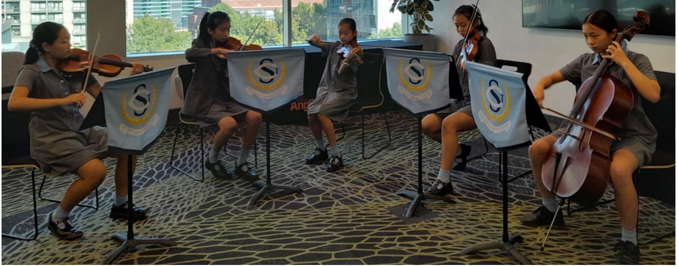
Photo: St Catherine's School string quartet