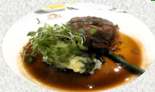
Roasted beef fillet wrapped in prosciutto With colcannon potato and sauce bery