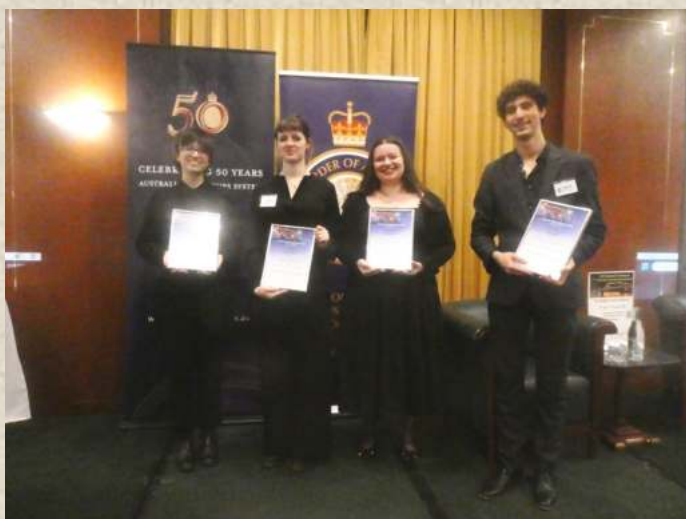
The Western Suburbs String Quartet presented with their Certificates of Appreciation