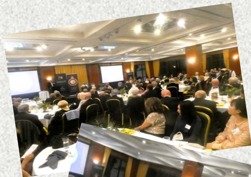
Portion of the 157 guests assembled in the Tattersall's Club Grand Ballroom at the Gala Dinner on Monday 9 June 2025