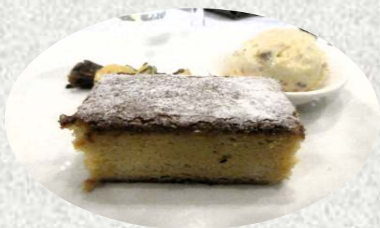
Orange and almond cake With orange date salsa and baklava ice cream