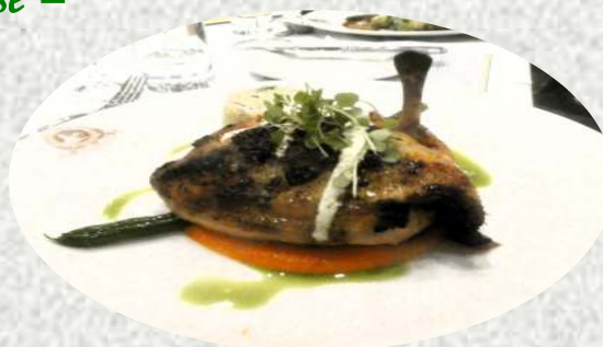
Harissa maple glazed chicken breast With carrot puree, lemon herb cous cous and spiced yogurt