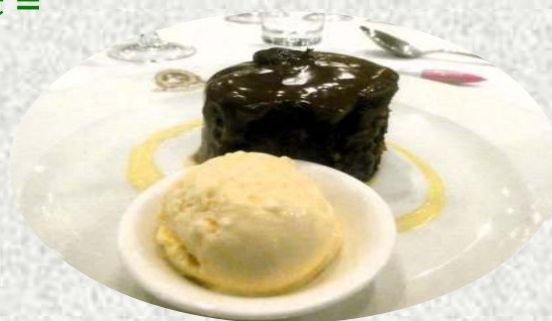
Sticky date pudding With caramel sauce and vanilla ice cream