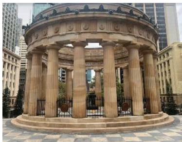
Service at Anzac Square