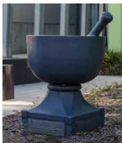
Tour UQ Campus Art