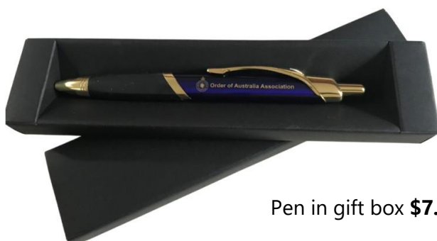
Pen in gift box $7.00

OAA items are also most suitable as gifts to new recipients