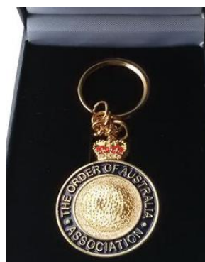
Key ring in gift box $12.00

All items and others in the OAA range can be purchased at www.theorderofaustralia.asn.au/shopping-cart