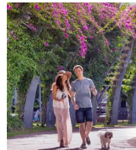
Stroll through South Bank