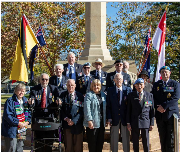
Members of the SA/NT Branch, NMBVAA after the Malayan Emergency 75th Anniversary service on 31 May 2025.