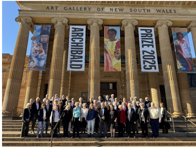
Photo of the group on the steps of the Art Gallery of N.S.W