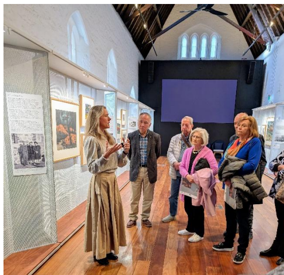
Photo of the group hearing about 'Once Known'