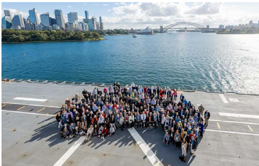
Photo: Conference Delegates on the flight deck of HMAS Adelaide in an "Australia" formation

The excellent line up of speakers were of the highest calibre and certainly captured the true essence of our conference theme of Celebrate | Motivate | Nominate, "Inspiring Australian Achievers!" Our thanks to all the volunteers for their hard work and to our sponsors for their kindness, generosity and support of our Association enabling us to deliver very special "once in a lifetime" experiences for our delegates.