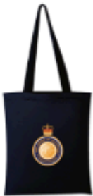
New tote bag

This is a selection of the Items that can be purchased online or via phone