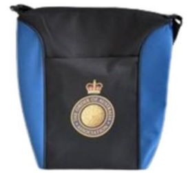
Cooler Bag $20.00