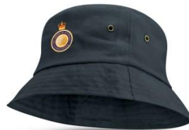
Bucket Hat $16.00