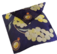
Blue Silk scarf $52.00