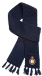
Blue Knit scarf $26.00