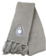
Grey Knit scarf $25.00