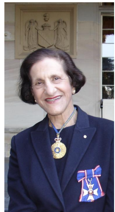
Photo of Dame Marie Bashir A.D. C.V.O

On behalf of the N.S.W Branch Committee and The Order of Australia Association, we convey the deepest and heartfelt condolences to Dame Marie's three children, six grandchildren and all her extended family.