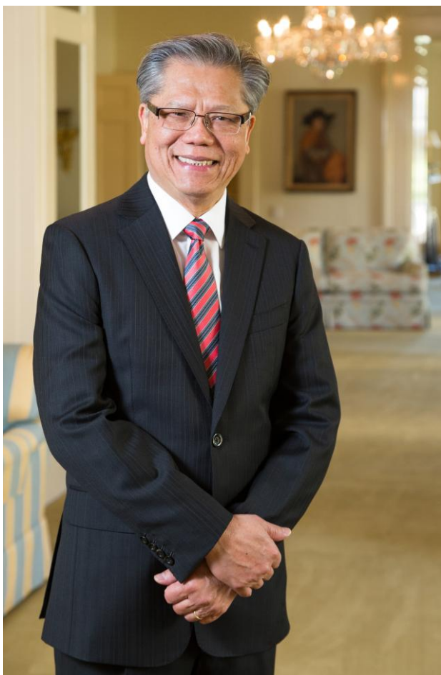
Photo showing incoming President The Honourable Hieu Van Le A.C.

On 1 September 2014, Mr Le was sworn in as the 35th Governor of South Australia. He concluded his term on 31 August 2021. During seven years in this role, Mr Le served as Patron of more than 230 organisations. It is understood that Mr Le is the first Vietnam-born person who has ever been appointed to a Vice-Regal position in the world.