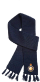
Blue Knit scarf $26.00