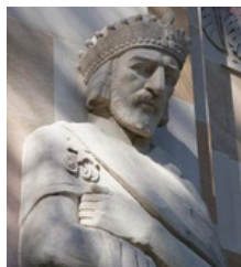
Uni Qld Sculptures