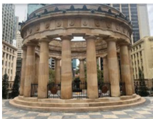
Service at Historic Anzac Square