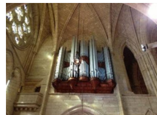
Organ Recital - Evensong