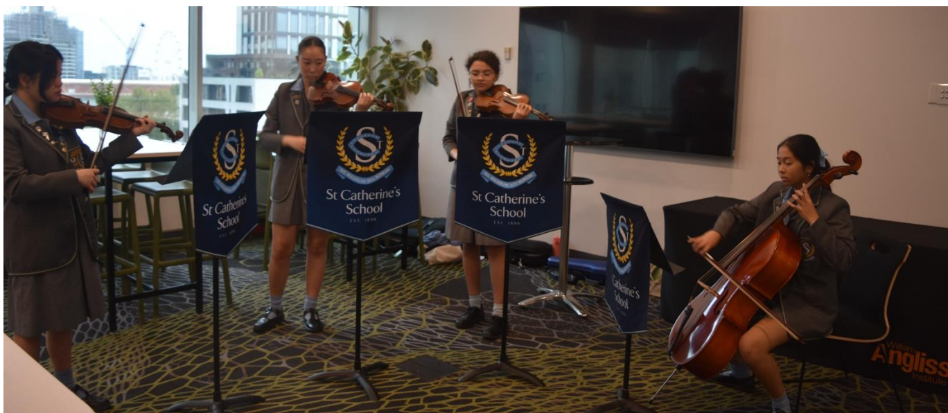
Photo: St Catherine's School string quartet

The Oration was inspiring as well as stimulating. It provided a challenge for all members of the audience to consider the theme of strengthening democracy during these challenging times, in ways that reflect contemporary and inclusive social values.