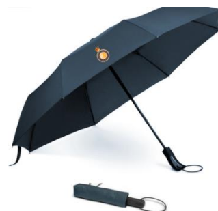
Compact navy 53cm auto opening & closing umbrella $30