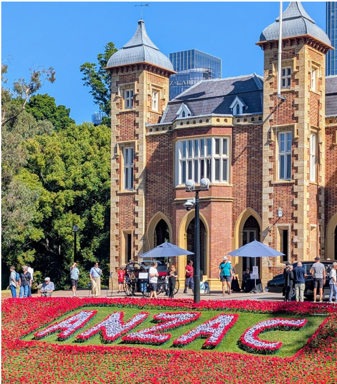
Cover photo: Government House W.A., where W.A. Branch members marked Anzac Day 2026.

Vision Impaired Accessible Document -- Dated May/June 2026