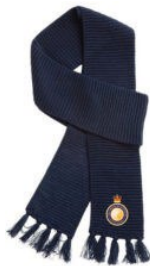
Blue knit scarf