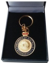
Key Ring in Gift Box

The items below are part of a selection of OAA Items that are available from $7.00 to $52.00 and can be purchased online at www.theorderofaustralia.asn.au/shopping-cart or via phone enquiries to Barb at 0413 008 571